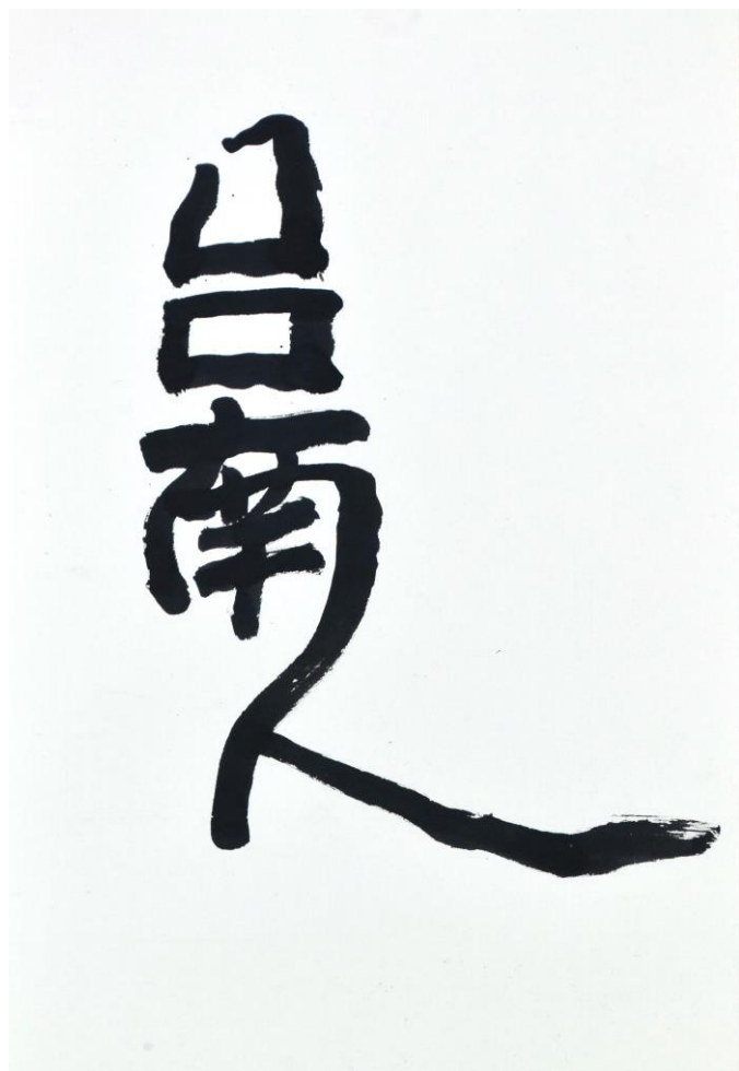
Fig. 2: Chen Shih-hsien, calligraphy of Tainan ren , ink on paper, 2005. Picture ©Chen Shih-hsien.

This reflection offered by Casey helps understand the importance of Chen Shih-Hsien's approach of "territoriality" ( tudi xing 土地性). When writing Tainan in the shape of the map of the island of Taiwan (fig. 2), all Taiwanese can understand, this interpretation of the graphic visual aspect of Tainan provides its inhabitants with the feeling of being in a real place, with a name conveying a temporal and historical dimension (Tainan is the former capital of Taiwan).