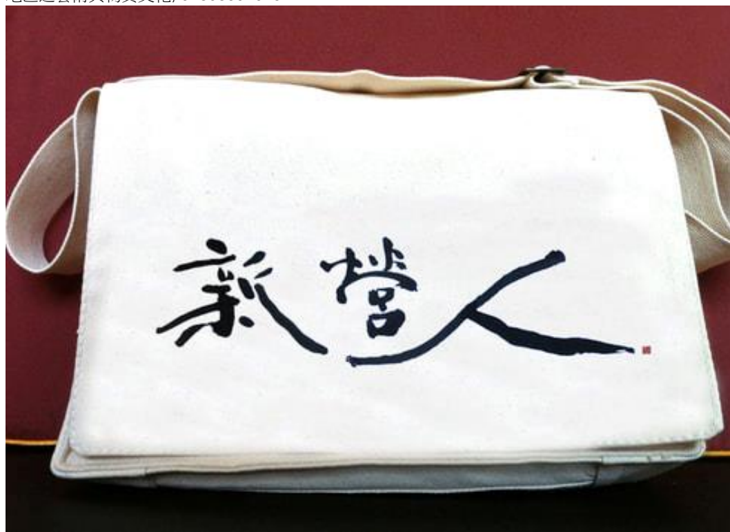
Fig. 10: Chen Shih-hsien, calligraphy of Xinying ren , printed on a schoolbag.