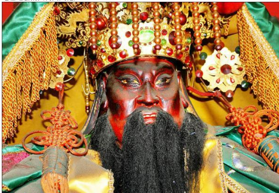
Fig. 12: A picture of Duke Guan in Guanmiao's Duke Guan Temple.

In Guanmiao's graphic writing, Chen Shih-Hsien pieces together the cultural and religious aspects of the place (duke Guan, the noodles), and the contemporary engagement in sport that characterises this district.