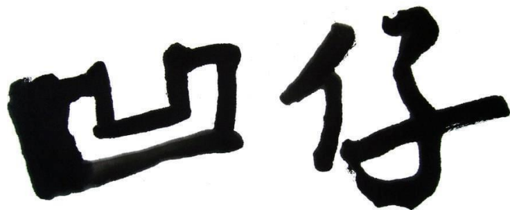
Fig. 8: Chen Shih-hsien, calligraphy of Aozi , ink on paper, 2003. Picture ©Chen Shih-hsien.

In the topographic writing of Aozi , “The Depressed” (fig. 8), the shape of the ao and first character itself is a pictogram. The calligrapher insists on the brushstrokes applied with considerable force.