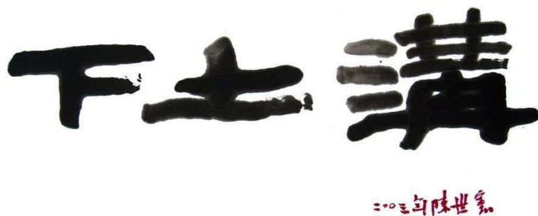
Fig. 5: Chen Shih-hsien, calligraphy of Xia Tugou , ink on paper, 2003.

In Xia Tugou (fig. 5), “Low Earth Ditch”, the brush effect is different altogether. The three characters have almost the same size, all of them are flattened.