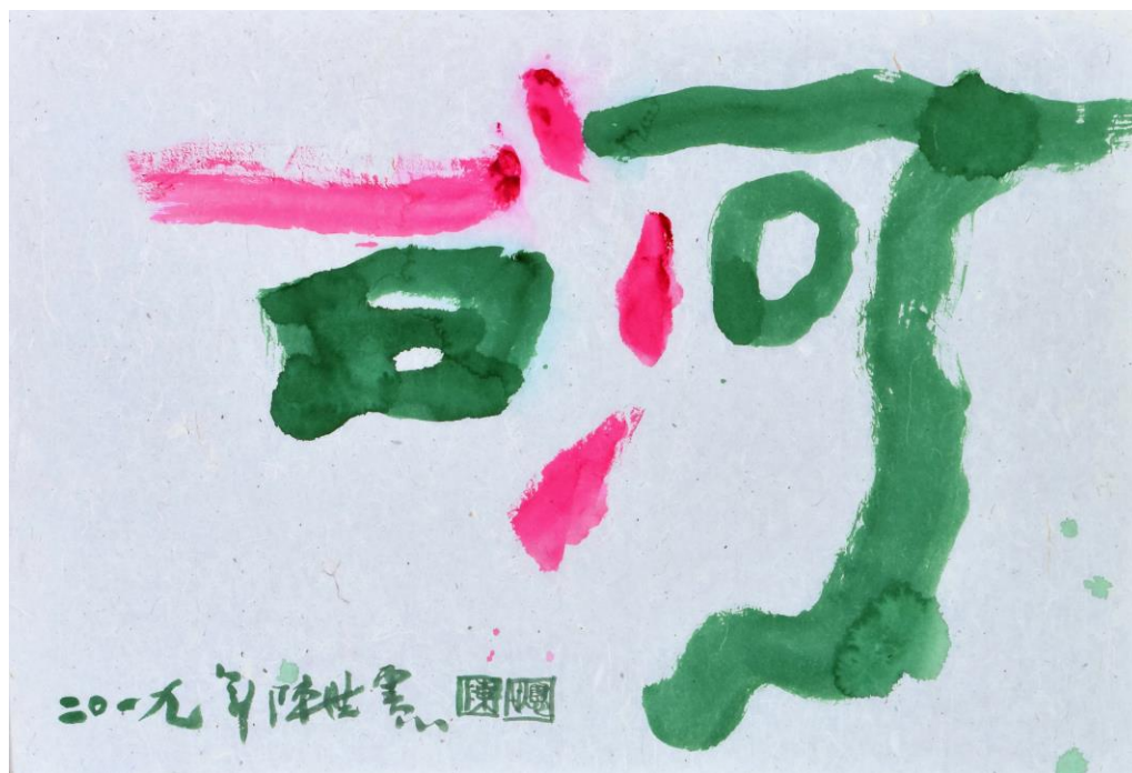
Fig. 1: Chen Shih-hsien, calligraphy of Bai-ho , colours on paper, 2019. Picture ©Chen Shih-hsien.

lotuses filling the landscape. When they bloom, the ponds shimmer with the green of the leaves and the pink of the flowers. That is why Chen Shih-Hsien calligraphies baihe not with black ink brushstrokes, as we should expect following traditional calligraphy's rules, but with green and pink brushstrokes (fig. 1).