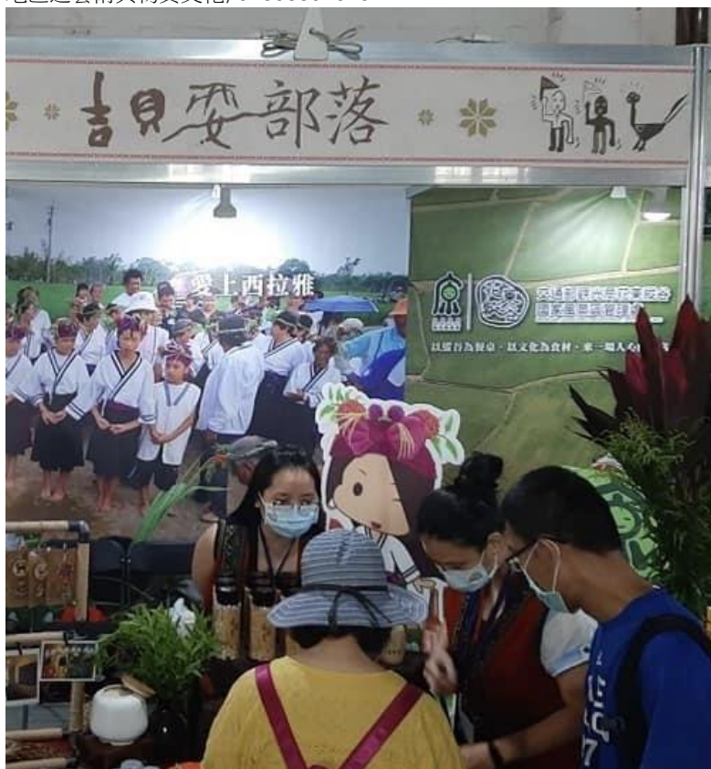
Fig. 13: Chen Shih-hsien, calligraphy of Kabuasua tribal cotton (Jibeishua buluo) , in the Siraya territory, 2003.

In 2003, Chen Shih-hsien created a calligraphy for an annual event occurring in the Siraya territory, around the blooming of the cotton flowers in spring. It was the second occasion he calligraphied “territorial writing” ( dizhi shufa ). 17