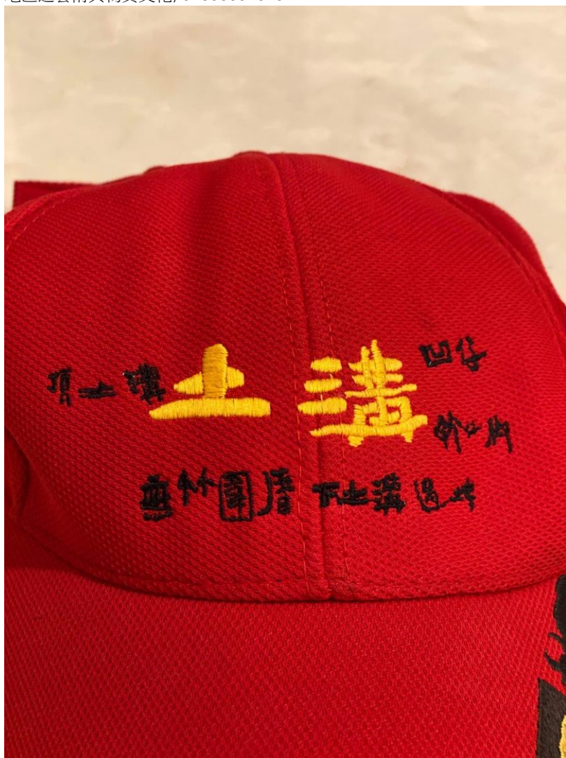
Fig. 3: Chen Shih-hsien, calligraphy of Tugou , and of the six villages of Ding Tugou, Xia Tugou, Aozhi, Zhuizi Jiao, Wuzhu Weicuo, and Guopi, embroidered on a cap. Picture ©Chen Shih-hsien.

Tugou is written twice by Chen Shih-hsien, once in Ding Tugou (fig. 4), and once in Xia Tugou (fig. 5). In both cases, the brushstroke has a similar effect of painstaking labour, but the characters are structured very differently, and the ink colour varies as well. The reading goes from the left to the right. In Ding Tugou, “Earth Ditch Heights”, there are three characters; the first one, ding , “top”, “up”, is upright, but the second, tu , “earth”, is bent, with the two horizontal strokes actually slightly higher on the right than on the left, while the vertical stroke is upright. This way of writing instils dynamism to the character. The third one, gou , is completely bent on the left. The effect is, when reading from the left to the right, that of climbing a slope uphill: at the outset, it is easy, then it turns more and more difficult. The brushstrokes are thick, the characters easy to recognize and read, but tu and gou leaning to the left give an impression of strain. That is exactly what Chen Shih-hsien intended to express, in order to conjure up the image of a painstaking