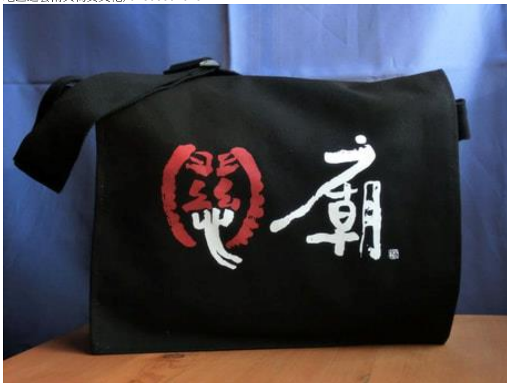
Fig. 11: Chen Shih-hsien, calligraphy of Guanmiao , printed on a schoolbag.

For Guanmiao 關廟 (fig. 11), a district South-East of Tainan, Chen Shih-Hsien asserts: