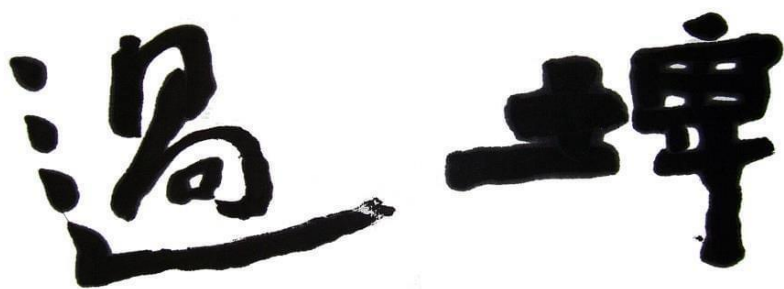
Fig. 7: Chen Shih-hsien, calligraphy of Guopi , ink on paper, 2003. Picture ©Chen Shih-hsien.

In the calligraphy of Guopi , “Go Over the Embankment” (fig. 7), the wrinkles of the water and the waves ripples are expressed with the three dots on the left, suggesting the trace of a paddle plunging regularly into the water; it is followed by a trembling horizontal brushstroke towards the right, probably suggesting a raft progressing in water.