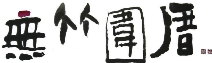
Fig. 6: Chen Shih-hsien, calligraphy of Wuzhu Weicuo , ink on paper, 2003. Picture ©Chen Shih-hsien.

因為前面竹子一大排，到這一個聚落變成沒有竹子來圍住了，於是，觀看夕陽的時候就變得更清楚，於是，無的上面一點就是紅色的。