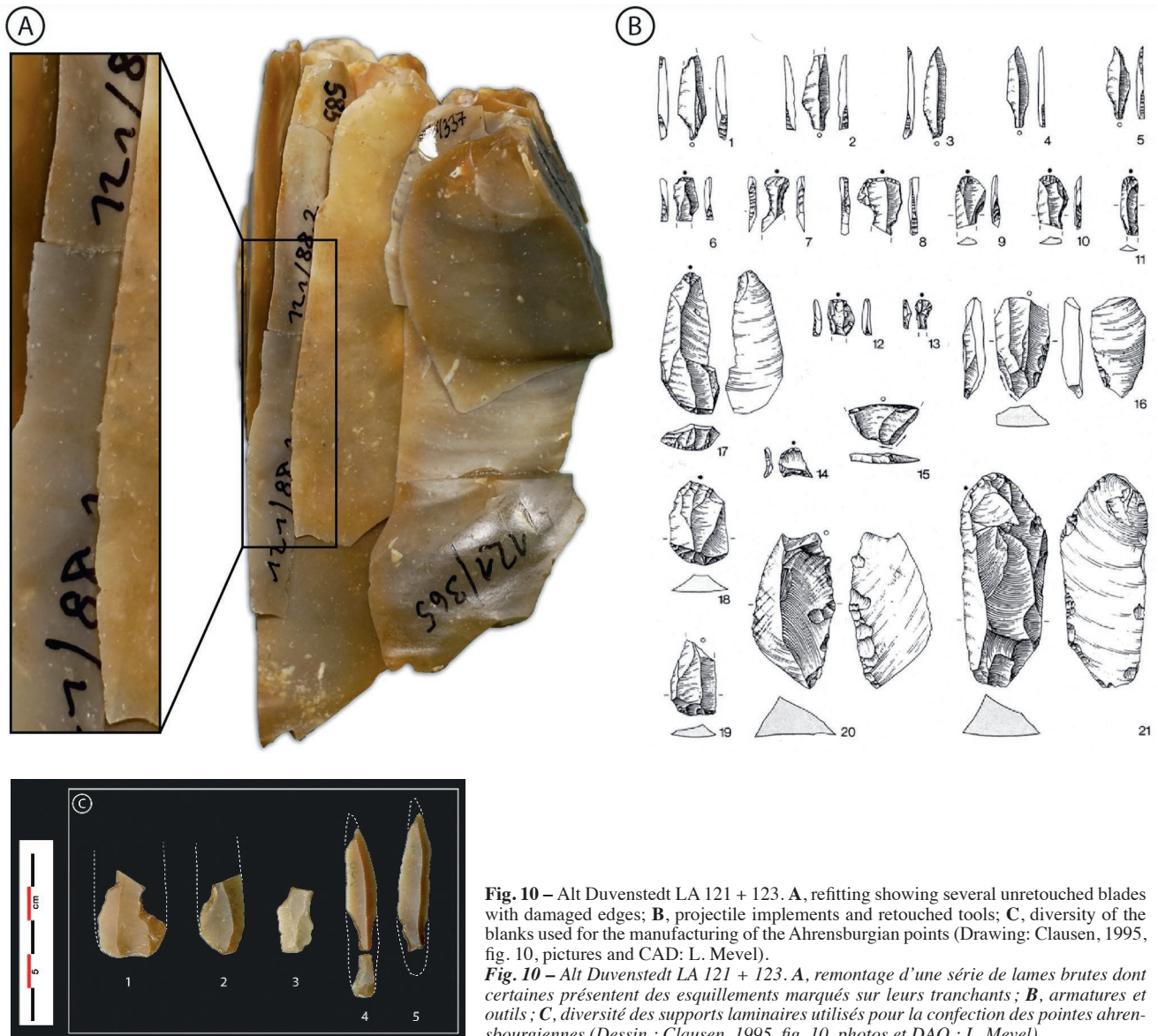
Fig. 10 – Alt Duvenstedt LA 121 + 123. A , refitting showing several unretouched blades with damaged edges; B , projectile implements and retouched tools; C , diversity of the blanks used for the manufacturing of the Ahrensburgian points (Drawing: Clausen, 1995, fig. 10, pictures and CAD: L. Mevel).

Fig. 10 – Alt Duvenstedt LA 121 + 123. A , remontage d'une série de lames brutes dont certaines présentent des esquillements marqués sur leurs tranchants; B , armatures et outils; C , diversité des supports laminaires utilisés pour la confection des pointes ahrensburgiennes (Dessin : Clausen, 1995, fig. 10, photos et DAO : L. Mevel).