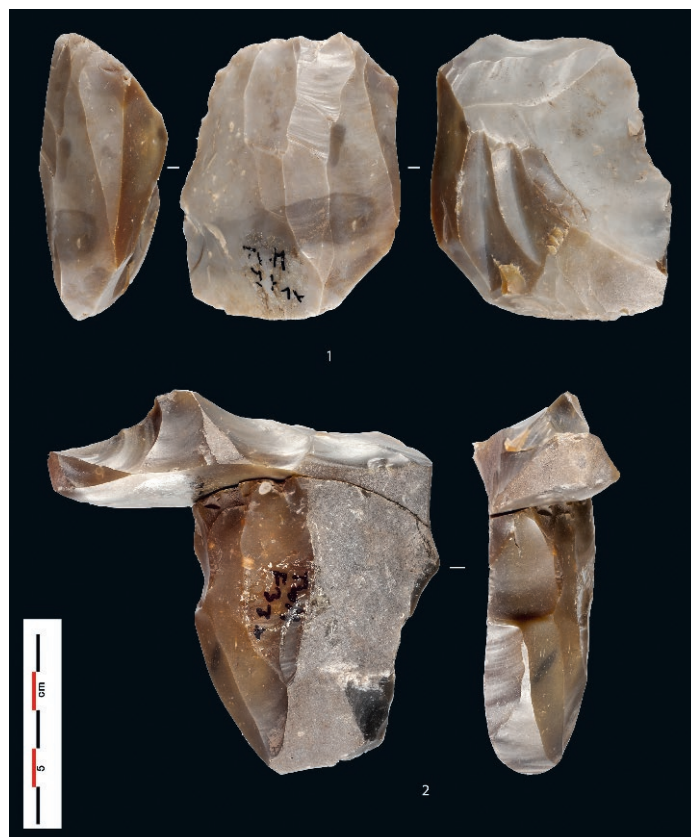
Fig. 9 – Teltwisch-Mitte. Blade cores (Pictures: Stiftung Schleswig-Holsteinische Landesmuseen Schloss Gottorf, CAD: L. Mevel).

Alt Duvenstedt LA 121 + 123, excavated in 1992 and 1994 as well as 2001, are two small adjacent concentrations with relatively few artefacts spread