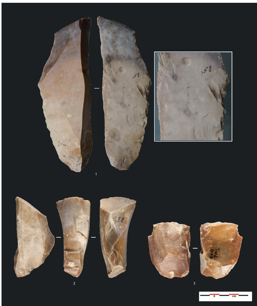
Fig. 3 – Teltwisch 2. 1, bruised blade; 2-3, blade cores (CAD: L. Mevel).

state (fig. 3, no. 1). However, this does not necessarily indicate that they have been part of a systematic production of such blades, in particular as they serve configuration purposes on different surfaces ( e.g. platforms and flaking faces). Due to the absence of extensive refit complexes, it is not possible to determine what the intentions underlying this production are and if Long Blades are systematically part of the objectives of the knappers. The stage of exhaustion of many cores does not allow either to affirm this. Two thirds of the cores have been abandoned at the stage of production of short (c. 50 to 70 mm long) blades or bladelets (width < 10 mm), so the initial state of these volumes is difficult or even impossible to evaluate (fig. 3, nos 2 and 3).