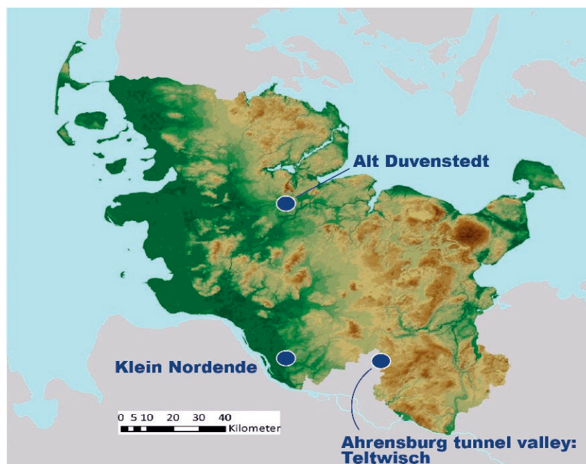
Fig. 1 – Map of the studied sites in Schleswig-Holstein. Basic map: Stiftung Schleswig-Holsteinische Landesmuseen Schloss Gottorf.

The chosen assemblages partly contain many artefacts, so it was necessary to sample some of them for our study. The view we obtained is of course partial but we are able to illustrate it by refits and representative quantitative data (table 1). This is the case for Teltwisch-Mitte, which is considered by its excavator as an older Ahrensburgian unit due to the absence of