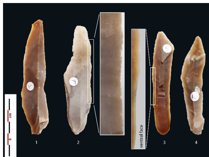
Fig. 7 – Teltwisch-Mitte. Regular unretouched blades with edge damage (CAD: L. Mevel).

Fig. 6 – Teltwisch-Mitte. 1-4, grattoirs; 5-6, burins; 7-12, pointes ahrensbourgiennes; 13-14, micro-burins (DAO : L. Mevel).