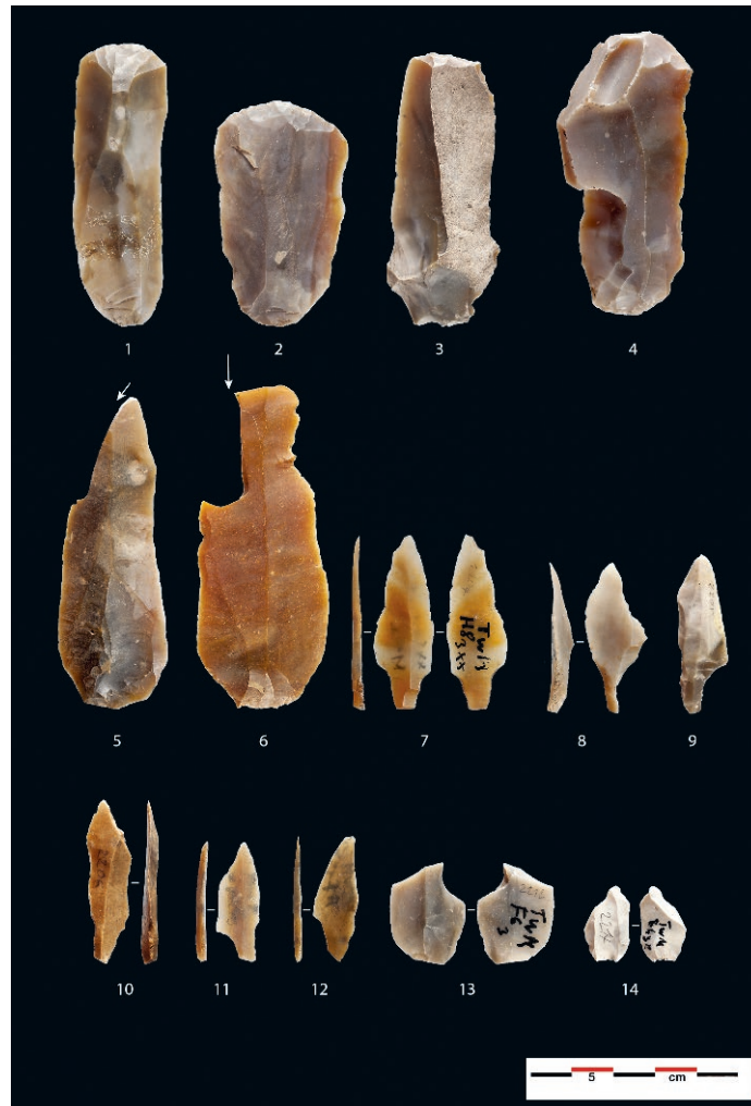
Fig. 6 – Teltwisch-Mitte. 1-4, end scrapers; 5-6, burins; 7-12, Ahrensburgian points; 13-14, micro-burins (Pictures: Stiftung Schleswig-Holsteinische Landesmuseen Schloss Gottorf, CAD: L. Mevel).

Fig. 6 – Teltwisch-Mitte. 1-4, grattoirs; 5-6, burins; 7-12, pointes ahrensbourgiennes; 13-14, micro-burins (Photos : Stiftung Schleswig-Holsteinische Landesmuseen Schloss Gottorf, DAO : L. Mevel).