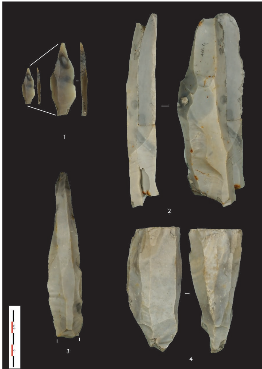
Fig. 5 – Klein Nordende LA 46. 1 , Ahrensburgian point; 2 , refitting of two Long Blades; 3 , blade from main blank production sequence?; 4 , blade core (CAD: L. Mevel).

Fig. 5 – Klein Nordende LA 46. 1 , pointe Ahrensbourgienne ; 2 , remontage de deux longues lames ; 3 , lame de plein débitage ? ; 4 , nucléus à lames (DAO : L. Mevel).