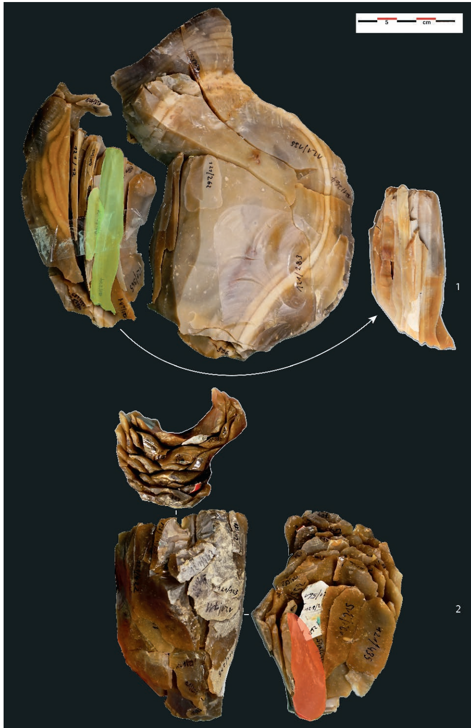
Fig. 11 – Alt Duvenstedt LA 121 + 123. Examples of two exhaustive refittings of blade production. 1 , the first blade of the reduction sequence yielding intentional products has been transformed into an Ahrensburgian point; 2 , only one of the last blades produced was transformed into an end scraper (in red on the picture; Pictures and CAD: L. Mevel).

Moreover, except for the Ahrensburgian point blanks – which were produced in different sequences