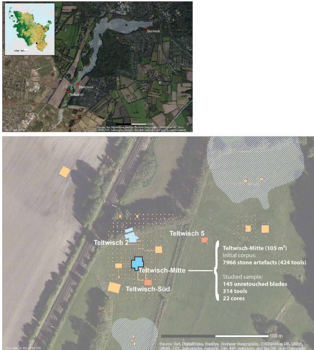
Fig. 2 – A , localization of the Teltwisch sites in the Ahrensburg tunnel valley; B , localization of the different excavation areas and detailed view of the studied corpus from Teltwisch-Mitte (Map: Stiftung Schleswig-Holsteinische Landesmuseen Schloss Gottorf, excavation plan: Tromnau, 1975, fig. 23).

Fig. 2 – A , localisation des gisements de Teltwisch dans la vallée d'Ahrensbourg; B , localisation des différents secteurs fouillés et détail du corpus étudié pour Teltwisch-Mitte (Carte : Stiftung Schleswig-Holsteinische Landesmuseen Schloss Gottorf, plan de fouilles : Tromnau 1975, fig. 23).