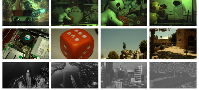
Fig. 2. Some test images of the CRVD indoor (1st row), Colom (2nd row) and Synth-Drone (3rd row) datasets. For color images, each channel is evaluated independently, resulting in one NLF per channel.

We added intensity-dependent simulated noise with a