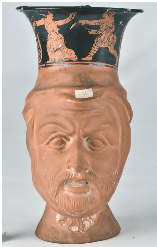
1. Ruvo di Puglia, Museo Nazionale Jatta, Inv. no. 1515. Red-figured head vase, Class W, The Persian Class (Sub-Meidian), 420/400. Photograph courtesy of Photographic archive Museo Nazionale Jatta—Ruvo di Puglia. Images used by permission of Direzione Regionale Musei Puglia—Italian Ministry of Cultural Heritage and Tourism.

In the imagery of the fourth century, the historical Persian virtually disappears, even though in life the Persian Empire figured in all Greek strategic and military calculations and the fifth-century public arts of Athens continued to present conspicuous reminders of victory against Persians. 10 In place of the historical or veristic mode a range of constructs develop that strip from the Persian his quality as a warrior. A hint of what is to come appears on the neck of the Persian head vase, where a youth in Persian dress pursues a peplos-wearing woman who looks back to him coquettishly [Fig. 1].