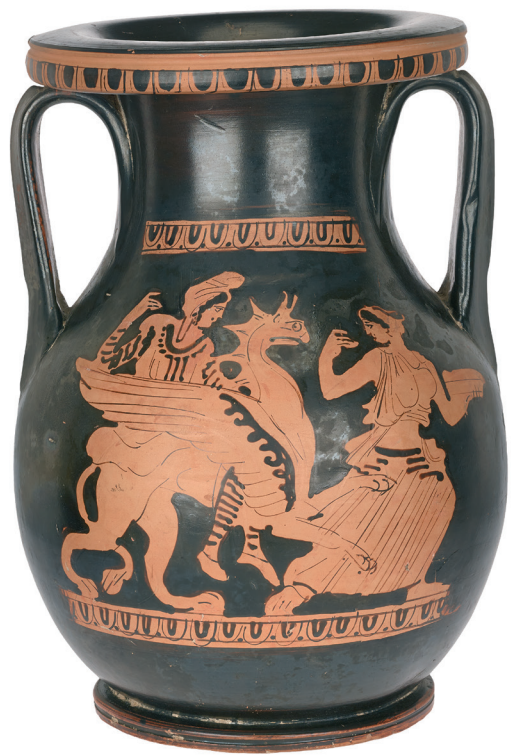
3. Mainz, Römisch-Germanisches Zentralmuseum, Inv. no. O.17298. Red-figured pelike, 400–375, Unattributed.

The other side of these kraters with griffin-riding youths presents a less friendly relationship with griffins: a single youth in larger scale, wearing Persian-looking dress and bearing a pelta shield, defends himself with spear against a griffin. The griffin rears up in attack. On the London krater, it seems to leap down from higher ground at left. A long tradition of scholarship sees such compositions as a battle