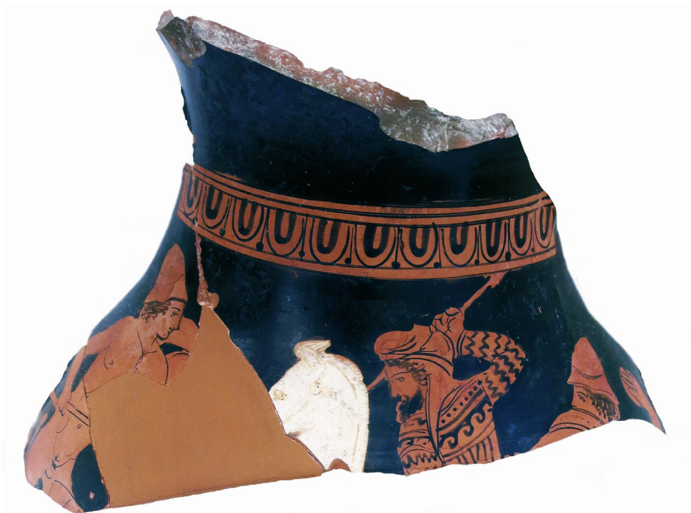
8. Pella, Archaeological Museum Inv. no. 07/662. Red-figured pelike fragments, related to Pourtalès Ptr., ca. 380/370. The rights to the illustrated vase belong to the Hellenic Ministry of Culture and Sports (N3028/2002). The pelike 07/662 is under the jurisdiction of the Ephoreia of Classical Antiquities of Pella. Hellenic Ministry of Culture and Sports / Archaeological Resources Fund. Photograph by Margaret Miller, with permission.

fragmentary state of the pelike in Pella makes reading difficult, but while both Greeks wear a pilos helmet and carry a shield, the figure at right holds a stone. 50