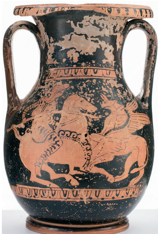
4. Sydney, University Chau Chak Wing Museum, Nicholson Collection, Inv. no. 98.04. Red-figured pelike, Painter of Sydney 44 name vase (McPhee), 370-350.

between griffins and Arimasps [see Fig. 4]. 21 Arimasps are mentioned in a range of classical sources as a people who live north(east) of the Black Sea; Herodotus knows of them as living beyond the Issedones and being one-eyed (4.13-14), a tradition also known to Aeschylus, who adds that they ride horses ( Prometheus Bound 804-805). One Aristeas of Proconnesus (in the Propontis), earliest mentioned by Herodotus in extant sources, reportedly composed an Arimaspeia that has been variously dated in a range between the later 7 th to early 5 th century. 22 The most succinct account is that of Pausanias's description of the helmet of Athena Parthenos (1.24.6); he explains that Arimasps fight with griffins who guard gold that comes from the earth. A handful of archaic representations may show such a subject. 23 On one Attic small squat lekythos of ca 380 in London, two white griffins with blue wings flank a mound covered with gilt nodules of extruded clay, doubtless meant to be the gold. 24