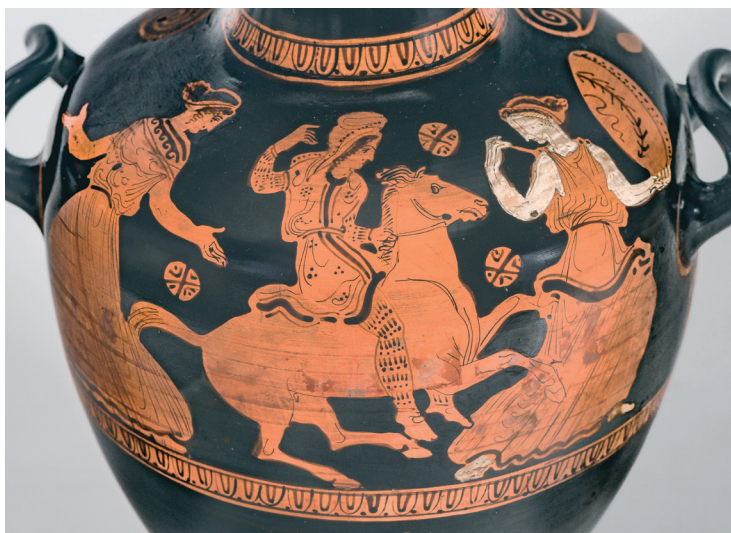
2. St. Petersburg, The State Hermitage Museum, Inv. no. GR-10515 (B-4550). Red-figured hydria, Europa Group (Kogiumtzi), ca. 375.

Elaborations on larger vessels include a Persian at centre on foot rushing to the right, with women on either side. 15 The Persian can be mounted on a horse, as most simply on an early fourth century pelike in New York with only one woman. 16 Two women moving to the sides appear on a hydria in St. Petersburg [Fig. 2]. 17 Here the peplos-wearing woman going to the right seems to hold