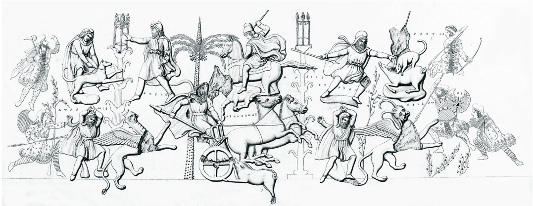
5. St. Petersburg, The State Hermitage Museum, Inv. no. Π1837. Red-figured and relief squat lekythos, Xenophantos, ca. 400. After drawing: Stephani, L., 1866, "Erklärung einiger Vasengemälde der kaiserlichen Ermitagen, Tafel 4," CRPetersb , p. 139-147. Atlas pl. IV

bearded man armed and equipped as a Persian raises his sword. 41 Much more familiar is the large relief squat lekythos signed by Xenophantos that depicts Persians engaging in a multiple-quarry hunt set in a paradeisos [Fig. 5]. 42 Many elements of the mold-made figures present high levels of ethnographic accuracy with regard to dress and equipment, such as the Persian riding cloths with distinctive borders. Here two features especially signify: first, several of the hunters are given explicitly Persian names, including Dareios and Kyros, and second, among the prey (boar and stag) are two griffins, one an eagle-griffin and the other the (much rarer and more certainly Persian) lion-griffin. These figures emphatically transport the Persians from the familiar to exotic lands. As Franks has put it, these Persians hunt at ἔσχατα γῆς, the very edges of the known world. 43 It was an easy step to suppose that this would especially take place in the far north-east of the Empire, the home of the Sogdians.