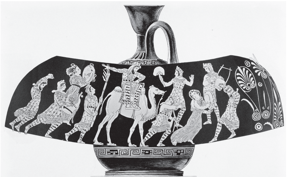
7. London, British Museum, Inv. no. 1882,0704.1 (E695). Red-figured squat lekythos, late Aison (Lezzi-Hafter), ca. 400. After drawing: Furtwängler, Adolf, and Karl Reichhold, 1904, 1909, 1932, Griechischen Vasenmalerei: Auswahl hervorragender Vasenbilder , I–III (Munich: F. Bruckmann). Taf. 78.