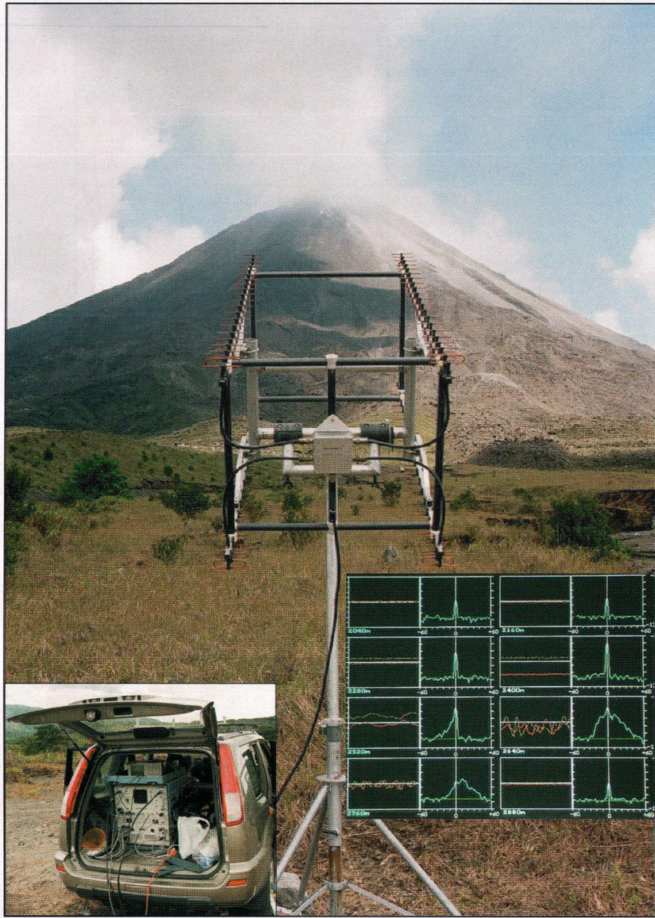
Fig. 1. The VOLDORAD (Volcano Doppler radar) antenna aimed at the summit of Arenal volcano 2.5 km away; the operating radar is in a four-wheel-drive vehicle (left inset) and provides signal real-time screen monitoring during an explosion (right inset).