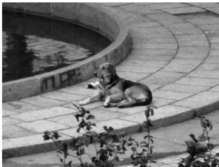
Figure 5. One of the dog packs in Plaza Perú, shared by people and dogs.

The stray dog pack that occupied Plaza Perú (Figure 5) comprised three or four dogs, the precise number varying depending on the day of the week or the time of day. Sometimes, the dogs even deserted the square altogether.