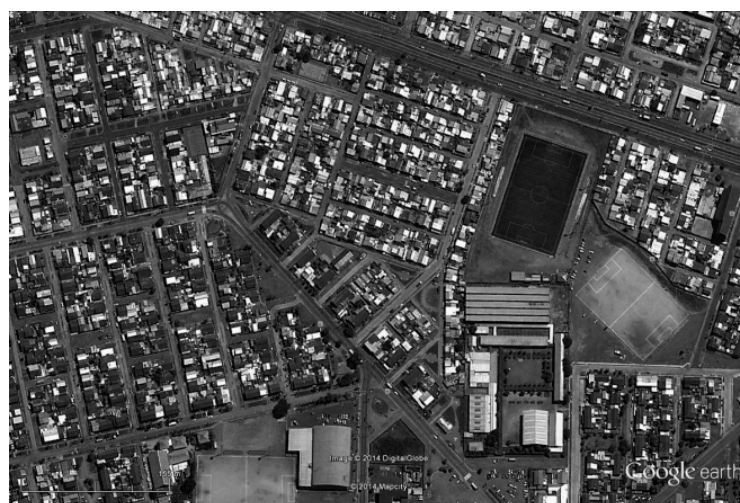
Figure 7. The spatial arrangement of the area including Yugoslavia Street, Hualpén.

Snoopy was a neighborhood dog in the residential sector of the municipality of Hualpén, in the Concepción metropolitan area (Figure 7), 8 km from Plaza Perú. He exemplified the behavioral adaptation of stray dogs in less central areas of Concepción, thus confirming the correlation between urban morphology and the adaptive behaviors of stray dogs, mediated by humans.