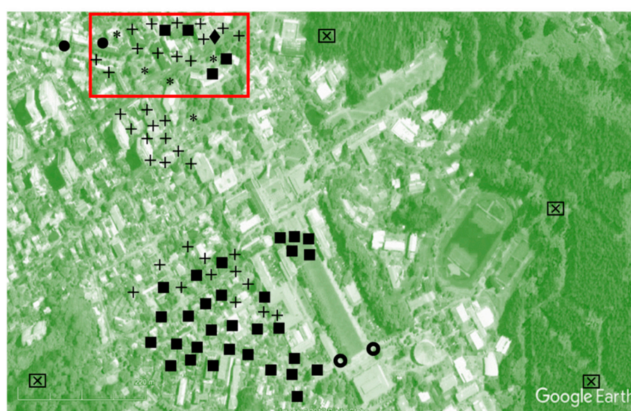
Figure 3. Distribution of dogs in the Plaza Perú area, Concepción. See Table 1 for the key to the signs.

This finding points to a dual behavioral plasticity: that of dogs and that of humans. The dogs that were present displayed various types of sociality with their conspecifics and with humans, as well as various types of adaptation to their habitat (house or apartment, streets and woods). In other words, they exhibited different territorialities, insofar as they had learned to live in eight specific sociospatial situations. We should not forget that dogs have a unique ability to form attachments to humans and to other dogs during their first 4 months of life (e.g., [1]). Additionally, dogs resist well to hunger and do not tend to search far and wide for food. Rather, they tend to move in close to a source of food and wait for it to come to them [51]. These abilities may facilitate varying forms of sociality and degrees of closeness to humans and conspecifics (i.e., sociabilities). We suggest that these different forms of dog sociality have arisen as a result of the human cultural and historical context. Whereas the presence of dogs in the home and on a leash is driven by Western culture, the presence of free dogs in and around Concepción (for detailed descriptions, see Table 1) is driven by the virtual absence of local and national