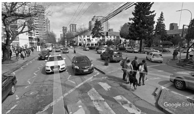
Figure 4. Crosswalk in Plaza Perú with a free-roaming dog on a traffic island between two roads crossing with people.

public health policies (see TV journals [72,73]). It is also the result of a cultural context in which dogs are viewed as animals that may not necessarily be tame or domesticated, but which can live freely around humans, using their food and shelter. Dogs are also often abandoned in an area (Lenga) far from the city center, along the end of the road at the beach, bordered by restaurants where local tourists come. They are not in such good health as those in Concepción, and clearly belong to the Type II category of stray dogs that remain at a greater distance from people than the dogs in Concepción, probably because their groups are larger and thus appear scarier. Additionally, in Concepción, people behave as though the dogs were autonomous social agents that had their own space and habits in the city. Citydwellers' behavioral plasticity therefore consists of tolerating and managing all eight situations of dogs' social and spatial lives, contrary to typical Western cities that only tolerate pet and guard dogs and very few free-roaming owned dogs. To this respect, see [74] for an example of how representations of dogs and therefore practices toward them influence the cooperative behavior of guide dogs.