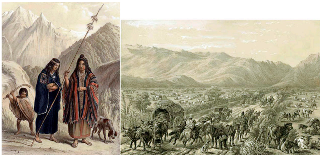
Figure 1. Left: Dogs were a common presence in Mesoamerican cultures (Mapuche). Right: Dogs accompanied the first European settlers in the 16th century [3].