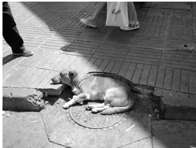
Figure 8. Stray dog in Valparaíso, lying on the street.

would dodge the animal without having even minimal contact with it, and vice versa. However, the dogs' greatest adaptation (i.e., showing how human lifestyles had influenced the dogs' habits and daily activities) concerned food. The stray dogs' itinerary through the city matched human work schedules. Dogs moved to and approached places and people related to food as if to see whether they could obtain nourishment. For example, dogs would approach the university in the morning as well as at midday, having learned that the students arrived with snacks. We also observed that some dogs settled near food stalls at peak times (i.e., when it was crowded). All these patterns make it possible to talk about parallel lives, with indirect relations between stray dogs and humans.