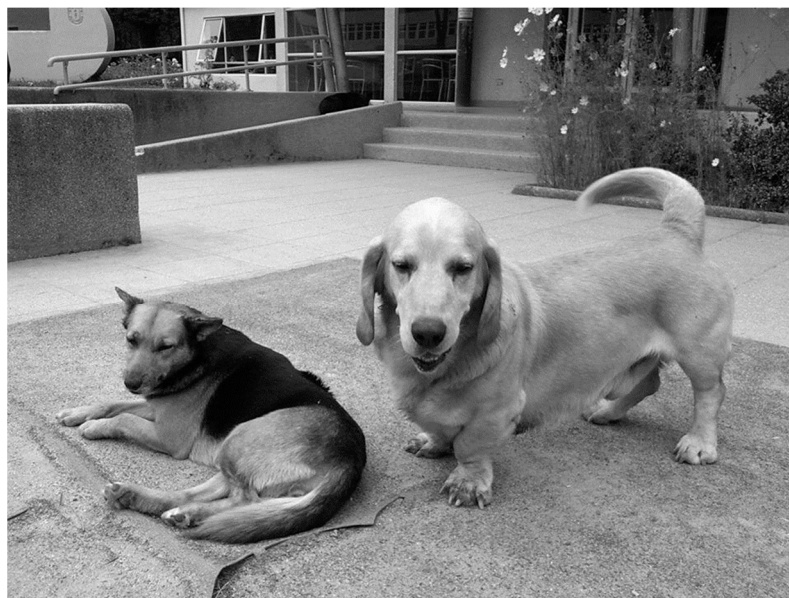
Figure 6. The famous free-ranging dog Sir Perro, and the basset. [92].

The first dog with an owner seen in the area was an old basset hound (Figure 6) who roamed the neighborhoods. Interestingly, he used to walk on the actual roadway with the cars, but very close to the sidewalk. As we never deliberately followed him in the course of our observations, the precise nature of his activities remains unknown, but he was observed walking on roads in different places up to 1 km apart, as well as close to other dogs (Figure 6).