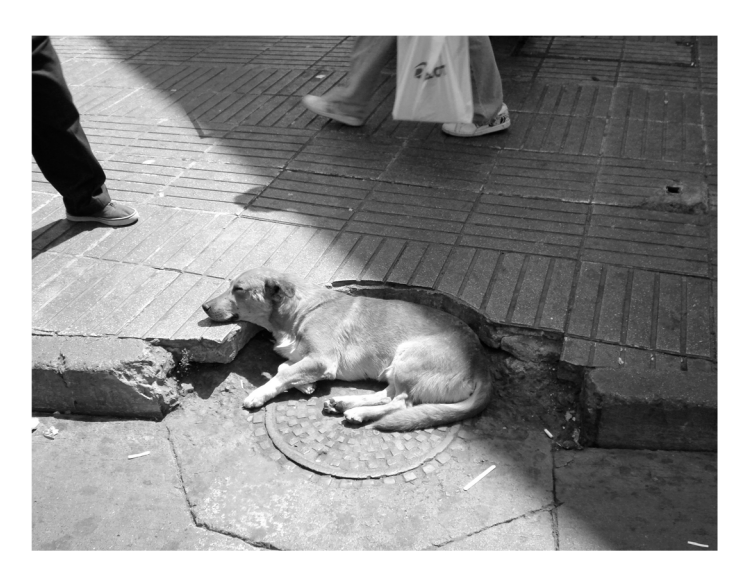
Figure 8. Stray dog in Valparaiso, lying on the street.

would dodge the animal without having even minimal contact with it, and vice versa. However, the dogs' greatest adaptation (i.e., showing how human lifestyles had influenced the dogs' habits and daily activities) concerned food. The stray dogs' itinerary through the city matched human work schedules. Dogs moved to and approached places and people related to food as if to see whether they could obtain nourishment. For example, dogs would approach the university in the morning as well as at midday, having learned that the students arrived with snacks. We also observed that some dogs settled near food stalls at peak times (i.e., when it was crowded). All these patterns make it possible to talk about parallel lives, with indirect relations between stray dogs and humans.