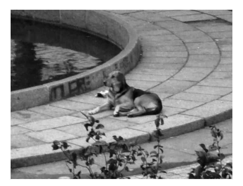
Figure 5. One of the dog packs in Plaza Perú, shared by people and dogs.

The stray dog pack that occupied Plaza Perú (Figure 5) comprised three or four dogs, the precise number varying depending on the day of the week or the time of day. Sometimes, the dogs even deserted the square altogether.