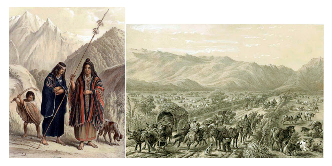
Figure 1. Left : Dogs were a common presence in Mesoamerican cultures (Mapuche). Right : Dogs accompanied the first European settlers in the 16th century [3].