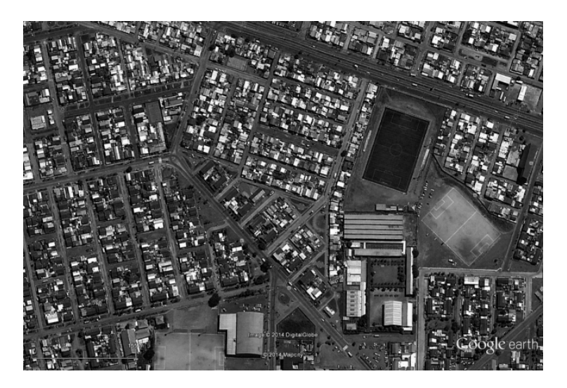
Figure 7. The spatial arrangement of the area including Yugoslavia Street, Hualpén.

Snoopy was a neighborhood dog in the residential sector of the municipality of Hualpén, in the Concepción metropolitan area (Figure 7), 8 km from Plaza Perú. He exemplified the behavioral adaptation of stray dogs in less central areas of Concepción, thus confirming the correlation between urban morphology and the adaptive behaviors of stray dogs, mediated by humans.