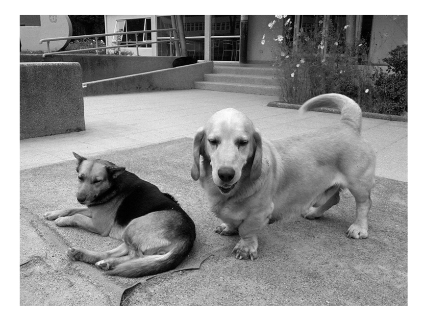
Figure 6. The famous free-ranging dog Sir Perro, and the basset. [92].

The first dog with an owner seen in the area was an old basset hound (Figure 6) who roamed the neighborhoods. Interestingly, he used to walk on the actual roadway with the cars, but very close to the sidewalk. As we never deliberately followed him in the course of our observations, the precise nature of his activities remains unknown, but he was observed walking on roads in different places up to 1 km apart, as well as close to other dogs (Figure 6).