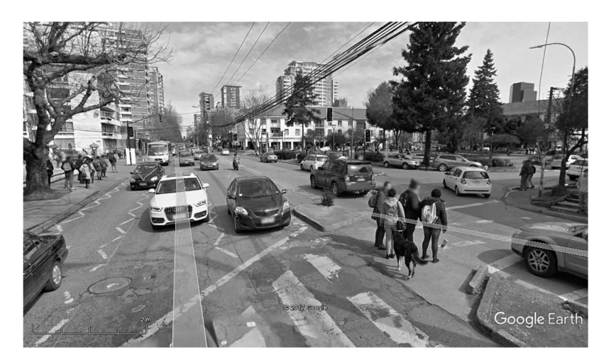
Figure 4. Crosswalk in Plaza Perú with a free-roaming dog on a traffic island between two roads crossing with people.

public health policies (see TV journals [72,73]). It is also the result of a cultural context in which dogs are viewed as animals that may not necessarily be tame or domesticated, but which can live freely around humans, using their food and shelter. Dogs are also often abandoned in an area (Lenga) far from the city center, along the end of the road at the beach, bordered by restaurants where local tourists come. They are not in such good health as those in Concepción, and clearly belong to the Type II category of stray dogs that remain at a greater distance from people than the dogs in Concepción, probably because their groups are larger and thus appear scarier. Additionally, in Concepción, people behave as though the dogs were autonomous social agents that had their own space and habits in the city. Citydwellers' behavioral plasticity therefore consists of tolerating and managing all eight situations of dogs' social and spatial lives, contrary to typical Western cities that only tolerate pet and guard dogs and very few free-roaming owned dogs. To this respect, see [74] for an example of how representations of dogs and therefore practices toward them influence the cooperative behavior of guide dogs.