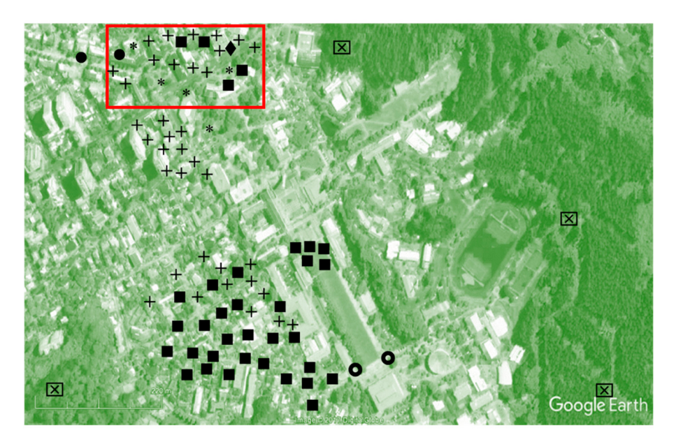
Figure 3. Distribution of dogs in the Plaza Perú area, Concepción. See Table 1 for the key to the signs.

This finding points to a dual behavioral plasticity: that of dogs and that of humans. The dogs that were present displayed various types of sociality with their conspecifics and with humans, as well as various types of adaptation to their habitat (house or apartment, streets and woods). In other words, they exhibited different territorialities, insofar as they had learned to live in eight specific sociospatial situations. We should not forget that dogs have a unique ability to form attachments to humans and to other dogs during their first 4 months of life (e.g., [1]). Additionally, dogs resist well to hunger and do not tend to search far and wide for food. Rather, they tend to move in close to a source of food and wait for it to come to them [51]. These abilities may facilitate varying forms of sociality and degrees of closeness to humans and conspecifics (i.e., sociabilities). We suggest that these different forms of dog sociality have arisen as a result of the human cultural and historical context. Whereas the presence of dogs in the home and on a leash is driven by Western culture, the presence of free dogs in and around Concepción (for detailed descriptions, see Table 1) is driven by the virtual absence of local and national