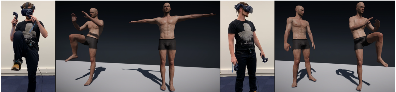
Figure 1: Tracked movements being recorded and replayed on a second virtual character.

LAMPA, Arts et Métiers Institute of Technology Changé, France