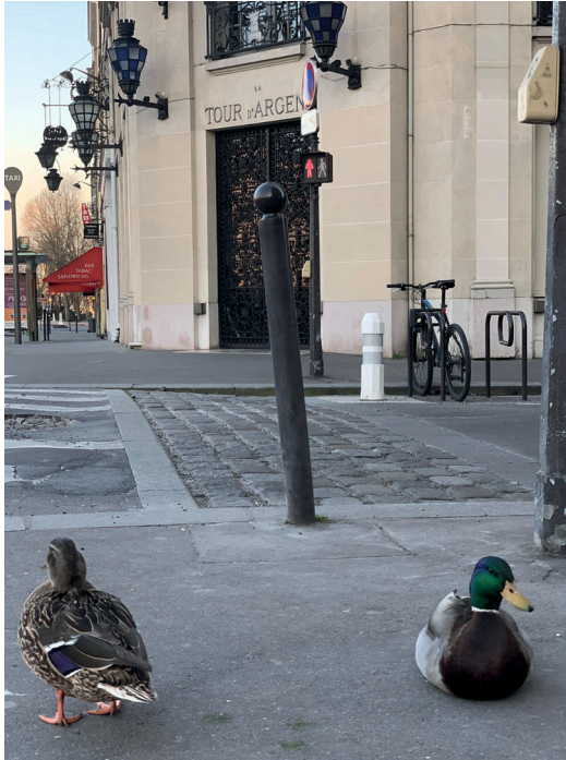
[Figure 2] Two ducks in front of the restaurant Tour d'Argent, Paris.