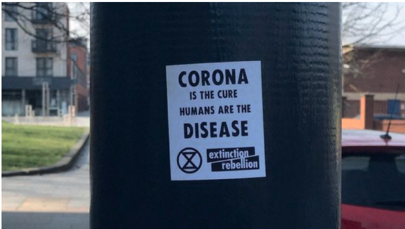
[Figure 3] False Extinction Rebellion sticker: "Corona is the cure, humans are the disease."

In what feels like a long time ago, in the far-away galaxy of our pre-pandemic world, self-proclaimed eco-fascists murdered a significant number of people in El Paso and Christchurch (Darby 2019). Eco-fascism certainly precedes the outbreak (Gardiner 2020). But as drone footage of emptied cities suggested