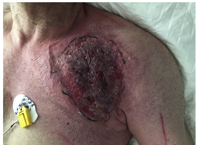
Figure 2 Pyoderma gangrenosum lesion with start of regression of necrotic lesions at day 20 after pacemaker implant.

In the field of cardiac device implantation, physicians should think about this rare diagnosis in all rapidly expanding postoperative lesions; postsurgery PG is already a classic entity. The delayed diagnosis can lead to serious consequences, as this initially sterile polynuclear infiltration lesion can later get infected. If the pathophysiological mechanisms are still not clearly elucidated, neutrophilic dermatoses can be assigned to autoinflammatory diseases with abnormal activation of innate immunity. In case of PG after PM implant, careful device reimplantation is possible with the help of adequate associated treatment therapies, usually involving steroids, colchicine, dapsone, cyclosporine, or TNF-blocking agents.