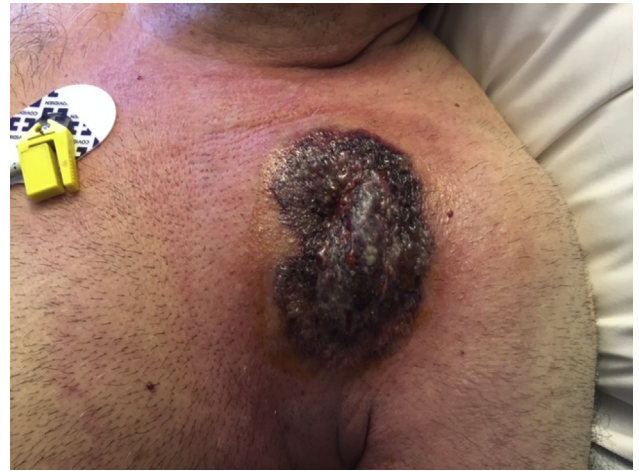
Figure 1 Pyoderma gangrenosum–specific initial lesion at day 7 after pacemaker implant.

Oral systemic corticosteroid (0.5–2 mg/kg/day) is considered as the first therapeutic option. In case of aggressive and