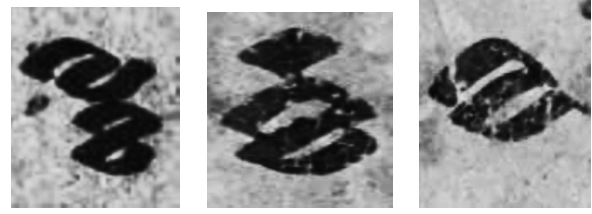
Figure 4. <wka> A 384 a3 (left), <rka> PK AS 7C a3 (center), <wa> PK AS 7C b2 (right)

In a recent study on the Tocharian B Buddhastotra verses (B 203–251 and B 71–76), Ogihara (2019) identifies ten fragments in the Lushun Museum collection that are parallel to B 203–206 and B 73–76. On the basis of these parallel texts, Ogihara attempts a reconstruction of the original Buddhastotra verses. Interestingly, the Lushun Museum parallel to B 73b2–3 reads kätkre kartse kele ywārśka (LM20-1552-11b1), with kartse ‘good, beautiful’ where the Berlin manuscript has wartse ‘broad’. Ogihara (2019: 33) argues that kartse is better supported by the philological evidence (this passage corresponds to Skt. gambhīra-nābhi- , literally ‘a deep navel (one of the eighty characteristics of a Buddha)’, which is translated in Chinese as ‘a deep and beautifully-shaped round navel’ (臍深圓好), with no mention of ‘broad’) 63 and that these variant readings can be explained if we suppose that the original manuscript was in archaic Tocharian B and had *kärtse . Due to the similarity of <wa> and <kā>, it appears that the scribe of the Berlin manuscript mistakenly wrote wartse while the scribe of the Lushun Museum manuscript replaced kärtse with the standard classical TB kartse .