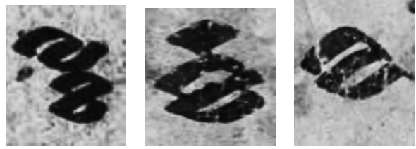
Figure 4. <wka> A 384 a3 (left), <rka> PK AS 7C a3 (center), <wa> PK AS 7C b2 (right)