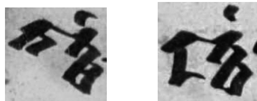
Figure 3. Examples of the ligature <ts> vs. <nt>: <nats> PK AS 2C b1 (left), <rant> PK AS 2A a4 (right)