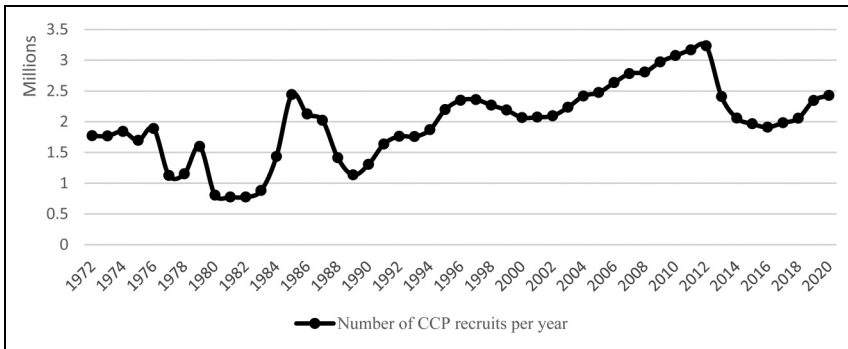
Figure 2. Trends in Chinese Communist Party Recruitment (1972–2020).