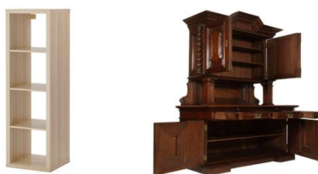
Figure 2. Presentation of the two drawing copy tasks. The basic task 1 (the shelf) and the complex task 2 (the buffet) are copied using Time2sketch software in a virtual environment.

The experiment was structured in 3 steps: (1) participants were asked to complete a series of questionnaires (socio-demographic, drawing experience, VR skills and mental rotation test); (2) then the participants were immersed in a neutral virtual environment (hangar) and were trained to use a VR sketching software named Time2sketch. There was no time limit for them to learn the software. Once they were familiar with the software, they had to perform the sketching tasks in virtual environment. The photos of the pieces of furniture (Fig. 2) to be reproduced in 3D appeared in the immersive environment. The two VR sketching tasks were presented randomly and consecutively to the participants. Participant had 10 min to make the basic task (the shelf – task 1) and 20 minutes for the complex task (the buffet – task 2). The instructions imposed were always the same: “reproduce the furniture as faithfully as possible, taking into account the volumes”. These two pieces of furniture have been selected according to their complexity. The shelf (task 1) is a simple task with a simple geometric shape, while the buffet is a complex task requiring to take into account the opening angle of the cabinets and drawers and many details. (3) Finally, the participants were asked to answer the SUS questionnaire.