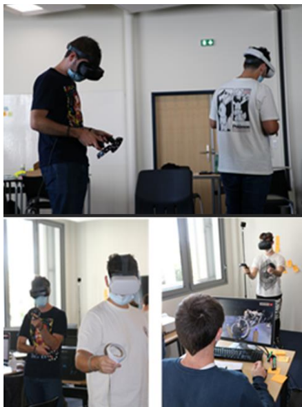
Figure 4. Users collaborating with the Time2sketch software.

Some limitations and perspectives appear with this study: firstly, we used students for the field experiment, which is not representative of a target population, even if it is close. For example, this excludes criteria such as the diversity of profiles related to age. Secondly, to the best of our knowledge, there are no scoring criteria for evaluating drawings in virtual reality. We therefore suggest our own criteria which would deserve to be evaluated on several studies with several judges. Thirdly, other types of 3D virtual reality drawing exist (e.g., Hyve-3D). The Hyve-3D [27] would allow to realize cleaner drawings but would have a longer learning process. It would be interesting to know which tools would be the most suitable for this kind of project with novice users.