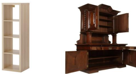
Figure 2. Presentation of the two drawing copy tasks. The basic task 1 (the shelf) and the complex task 2 (the buffet) are copied using Time2sketch software in a virtual environment.

The experiment was structured in 3 steps: (1) participants were asked to complete a series of questionnaires (socio-demographic, drawing experience, VR skills and mental rotation test); (2) then the participants were immersed in a neutral virtual environment (hangar) and were trained to use a VR sketching software named Time2sketch. There was no time limit for them to learn the software. Once they were familiar with the software, they had to perform the sketching tasks in virtual environment. The photos of the pieces of furniture (Fig. 2) to be reproduced in 3D appeared in the immersive environment. The two VR sketching tasks were presented randomly and consecutively to the participants. Participant had 10 min to make the basic task (the shelf – task 1) and 20 minutes for the complex task (the buffet – task 2). The instructions imposed were always the same: “reproduce the furniture as faithfully as possible, taking into account the volumes”. These two pieces of furniture have been selected according to their complexity. The shelf (task 1) is a simple task with a simple geometric shape, while the buffet is a complex task requiring to take into account the opening angle of the cabinets and drawers and many details. (3) Finally, the participants were asked to answer the SUS questionnaire.