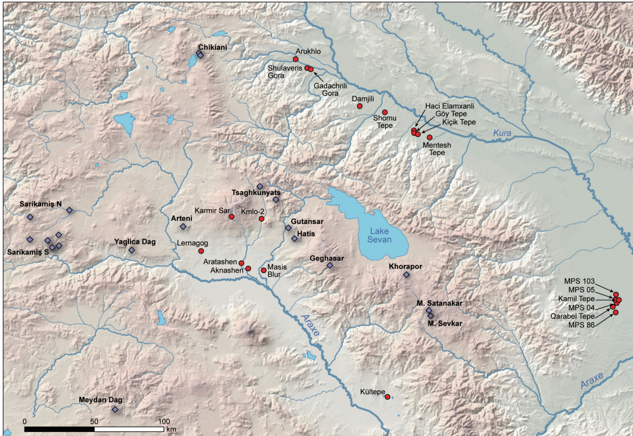
Fig. 1. Sites mentioned in the text.

such as backed bladelets and scalene triangles, and the 10 th -8 th millennia cal. BCE phases produced numerous obsidian tools, including microliths and 'Kmlö tools'. At Lernagog, also in Armenia (Arimura et al. 2018), Mesolithic occupation was identified and dated to the beginning of the 7 th millennium BCE. The lithic industry includes a few microliths and 'Kmlö tools'. Another important step in the research occurred when a Japanese and Azerbaijani team resumed the excavation of Damjili cave in Azerbaijan. They brought to light a Late Mesolithic level dated to the end of the 7 th millennium BCE (Nishiaki et al. 2019a). The lithic industry is characterized by the presence of pressure-flaked débitage and geometrics such as lunates, trapezes and teardrop-shaped pieces. The next level is Neolithic and dates to the middle of the 6 th millennium BCE. The industry shows the use of pressure flaking to produce blades with a width mean slightly higher than that of the Mesolithic period; blades are less frequent in the assemblage; a decrease in microliths that are only trapezes is noticed; wedges ( pièces esquillées ), burins and a few pressure-retouched blades ("Damjili tools") were noticed.