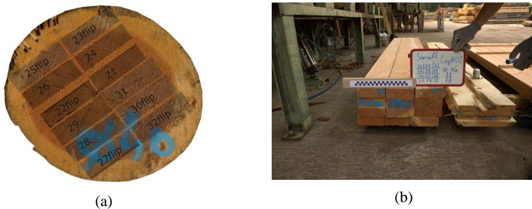
Fig. 2: (a) Manual positioning of the board end image for log #02 (flip means that the board end image had to be flipped to be in the right orientation); (b) A pile of boards from log #02.