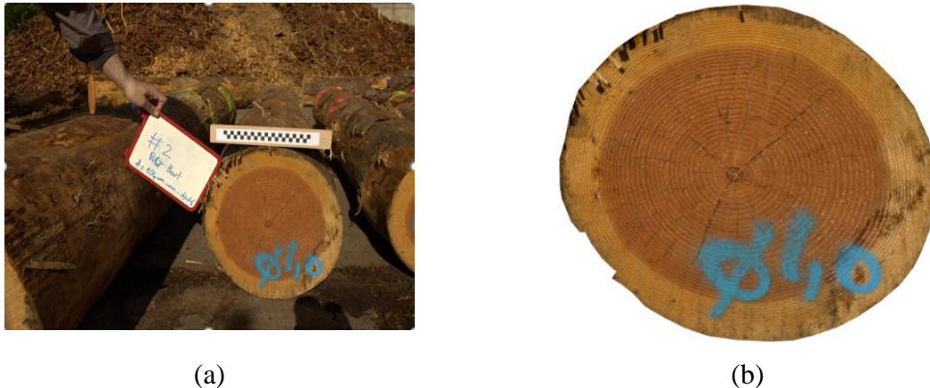
Fig. 1: Images of log #02: log end image taken on the log-yard ; the corresponding manually segmented log image.

(Swaroop and Sharma 2016). These methods are simple and intuitive, but tend to fail when images have large rotations, large illumination levels, large scale differences, etc. Conversely, the feature-based methods are generally invariant to scale, rotation, and illumination, etc. Among them, the scale invariant feature transform (SIFT) (Lowe 2003) method is most common. However, as with other feature-based algorithms, its matching performance depends strongly on the quality of feature extraction, which is sensible to noise.