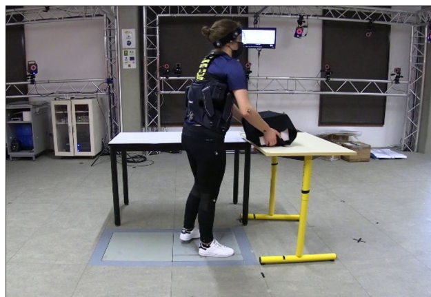
Figure 1. Transfer of a 5 kg box from one table to another (transfer movement).

Laboratory motion capture session was performed on 10 asymptomatic subjects (3♂ and 7♀, mean ± std, age: 20.2 ± 1.2 years, mass: 69.1 ± 10.9 kg, height: 1.76 ± 0.09) with a sequence of movements (Sghaier et al. 2019). The sequence of movements is as follows: trunk frontal bending, trunk lateral bending, trunk axial rotation, walking, walking carrying a 5 kg box,