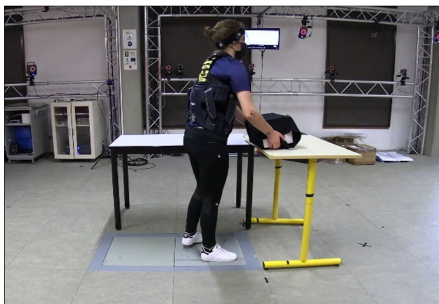
Figure 1. Transfer of a 5 kg box from one table to another (transfer movement).

Laboratory motion capture session was performed on 10 asymptomatic subjects (3♂ and 7♀, mean ± std, age: 20.2 ± 1.2 years, mass: 69.1 ± 10.9 kg, height: 1.76 ± 0.09) with a sequence of movements (Sghaier et al. 2019). The sequence of movements is as follows: trunk frontal bending, trunk lateral bending, trunk axial rotation, walking, walking carrying a 5 kg box,