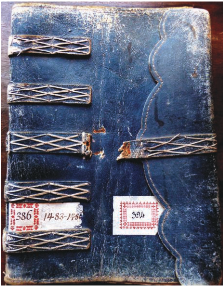
Fig.1. – The blue book, signed A (Libro azzuro, segnato A)

Consequently, to have the maximum amount of information, one needs to juggle between the registers, thanks to internal cross-references. These complex, seemingly dry sources are extremely rich and shed new light on the economic and social history of the time. Unfortunately, no book on the technical aspects of the dyeing activity of the firm having been preserved, all that can be known about Francesco Salviati's company therefore is: what dyestuffs, mordants and connected products were bought and used, in what quantities each year, how and from where they were obtained, at what prices. All this information allows to better understand the kind of dyeing in which he specialized.