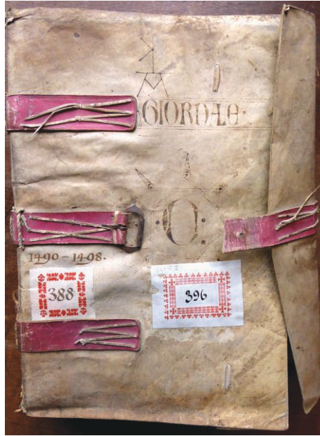
Fig. 3. – The Giornale , diary

Reg. 396 in the Salviati Archive, recording all daily activities from October 1490 to June 1498.