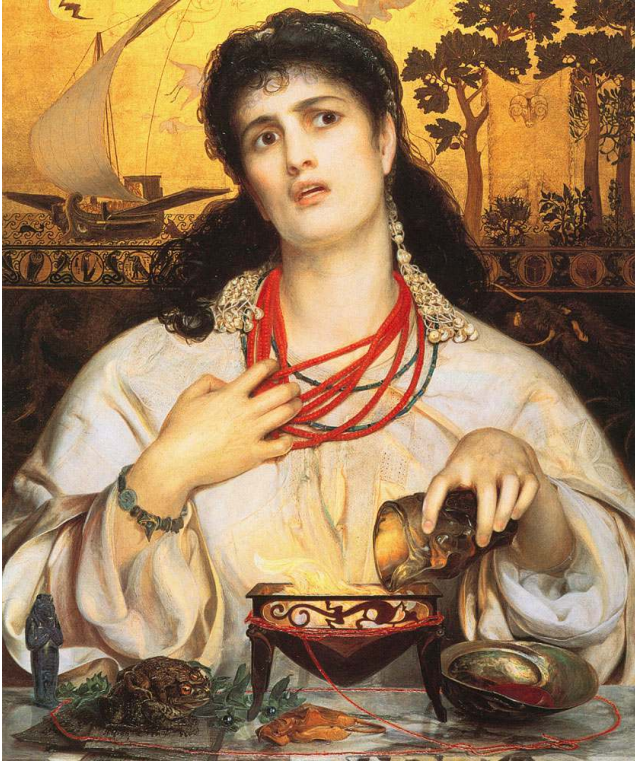
Frederick Sandys, Medea (1868), oil on canvas, 61.2x45.6cm, Birmingham Museum and Art Gallery, Creative Commons