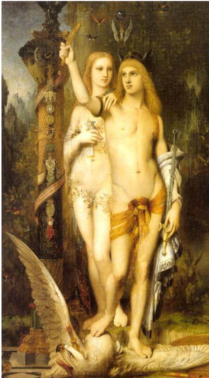
Gustave Moreau, Jason et Médée (1865), oil on canvas, 204x121.5cm, Musée d'Orsay, Paris, Creative Commons

painting of the mythical couple. 9 However, the complexion of Colchian women seems to have been dark rather than blond leading Peter Green to suggest that Medea may have had "prescriptions ( pharmaka ) to achieve so fashionable an appearance" as if she were in fact 'a bottle blond'" (Green 274). But Morris does not allude to such chromatic or capillary controversies: for him, Medea is simply fair, as becomes a divine princess, whether antique or medieval. Even if he makes her cover her blond hair and pale skin with a dark cloak when she performs her magic rituals, Morris's decision to emphasize Medea's diaphanous beauty contrasts strikingly with certain revisions of the classical myth, which depict her as a dark, dangerous sorceress and infanticide, as in Euripides' eponymous play. Morris's blond Medea, on the other hand, corresponds much more to the model of the "helper-maiden" (Clauss and Johnston 5-6), 10 resorting to white magic and beneficent pharmaka to save Jason from the dragon, as if the Victorian poet wanted to rehabilitate the reviled heroine. This is very much in keeping with Chaucer's Legend of Good Women as well as with Ovid's Heroides which both depict Medea in a favorable light, deliberately leaving aside references to her witchcraft and crimes.