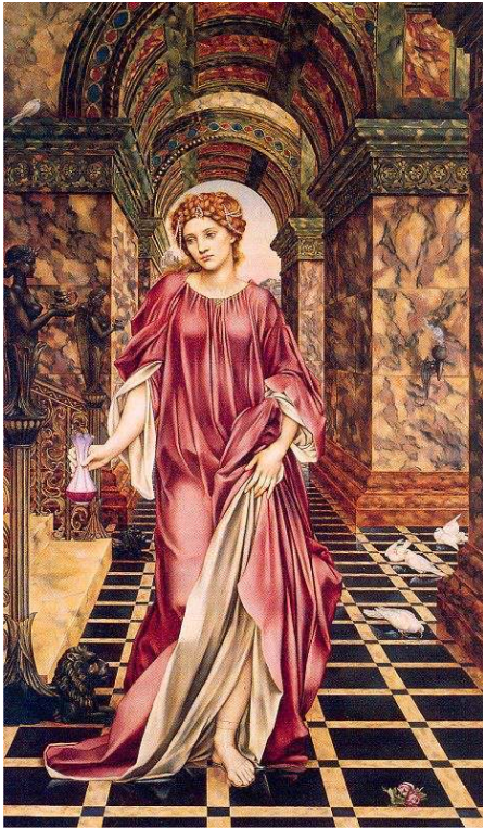
Evelyn de Morgan, Medea (1889), oil on canvas, Williamson Art Gallery and Museum, Birkenhead, UK