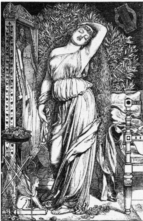
Danae in the Brazen Chamber (c. 1888), Joseph Swain, after Frederick Sandys, Wood engraving on India paper; proof, 18.4x12.1cm, Boston Museum of Fine Arts, Creative Commons