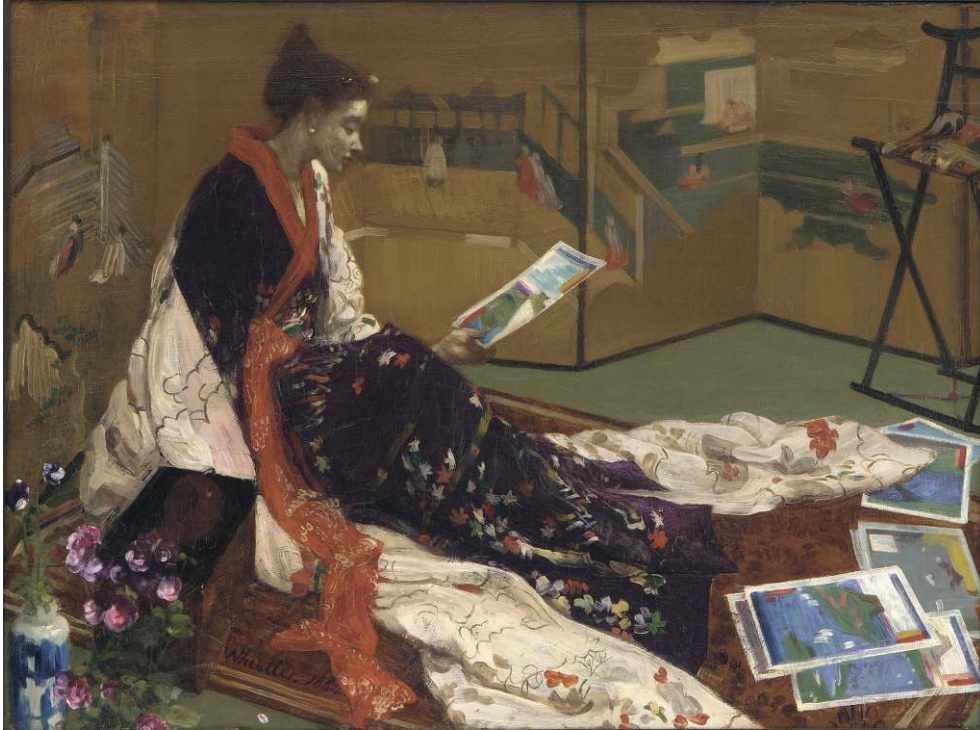
James Abbott McNeill Whistler, Caprice in Purple and Gold, The Golden Screen (1864), oil on panel, 50.1x68.5cm, Freer Gallery of Art, Creative Commons

and colour combinations in previous paintings, for instance for his sorceress Vivien (1863) who wears a golden Asian mantle. In Grace Rose (1866) we also find an antique Japanese painted screen with a gold ground which clearly prefigures the Medea . In keeping with the eclecticism of Morris's tale, this Greek and Japanese mural is inscribed with an anachronistic array of ancient Greek, Japanese, Chinese and Egyptian stylized motifs—again, text and image seem closely interwoven with gold immediately drawing the attention of the viewer to that complex interaction.