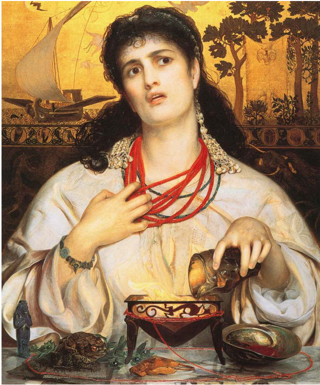
Frederick Sandys, Medea (1868), oil on canvas, 61.2x45.6cm, Birmingham Museum and Art Gallery, Creative Commons