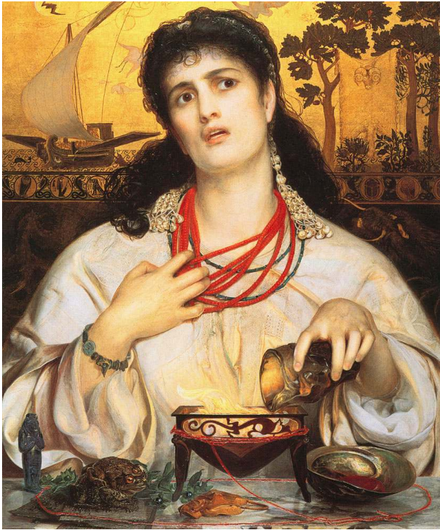
Frederick Sandys, Medea (1868), oil on canvas, 61.2x45.6cm, Birmingham Museum and Art Gallery, Creative Commons