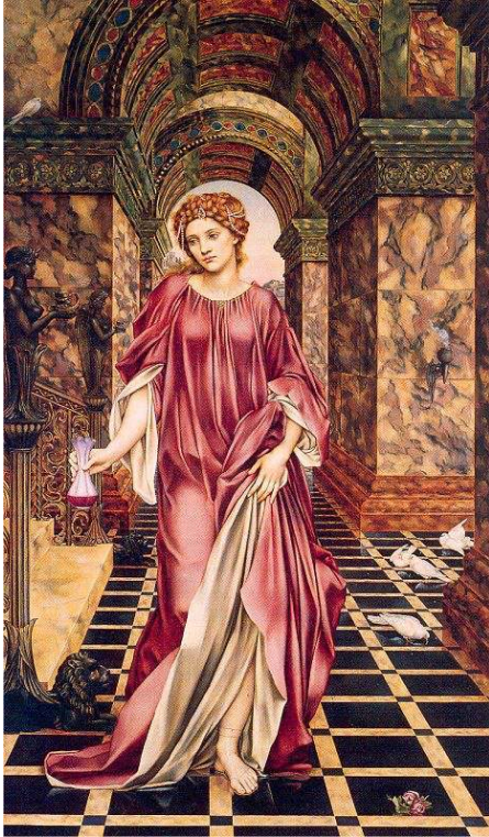
Evelyn de Morgan, Medea (1889), oil on canvas, Williamson Art Gallery and Museum, Birkenhead, UK, Creative Commons