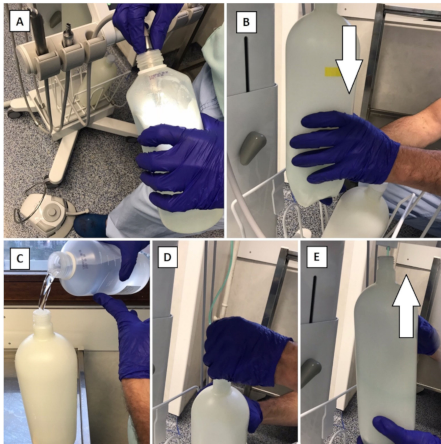
Figure 3. Parts of the maintenance protocol of the mobile dental delivery system (MDDS), before use and between each patient. (A) Purge of the air/water spray and the handpieces hoses with the Calbenium© solution; (B) removal of the reservoir that contains the Calbenium© solution; (C) filling of another reservoir with sterile water; (D,E) placement of the reservoir containing sterile water.