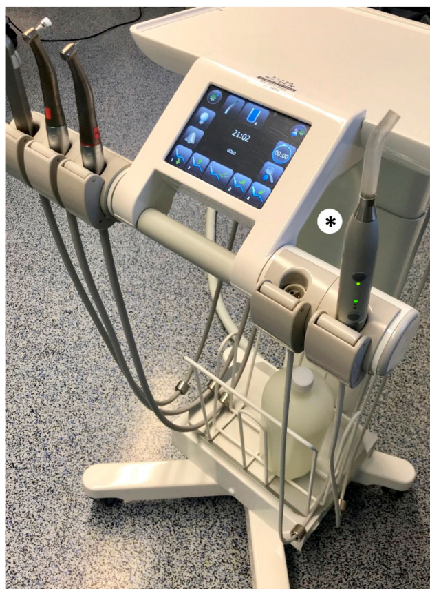
Figure 1. Mobile dental delivery service. * water reservoir.

In addition, to reach patients who live in areas not provided with dental surgeons, or to gain access to destitute and vulnerable patients, MDDSs can be used in a hospital environment, from room to room, or associated to the delivery of dental care under general anesthesia (GA) in an operating room.