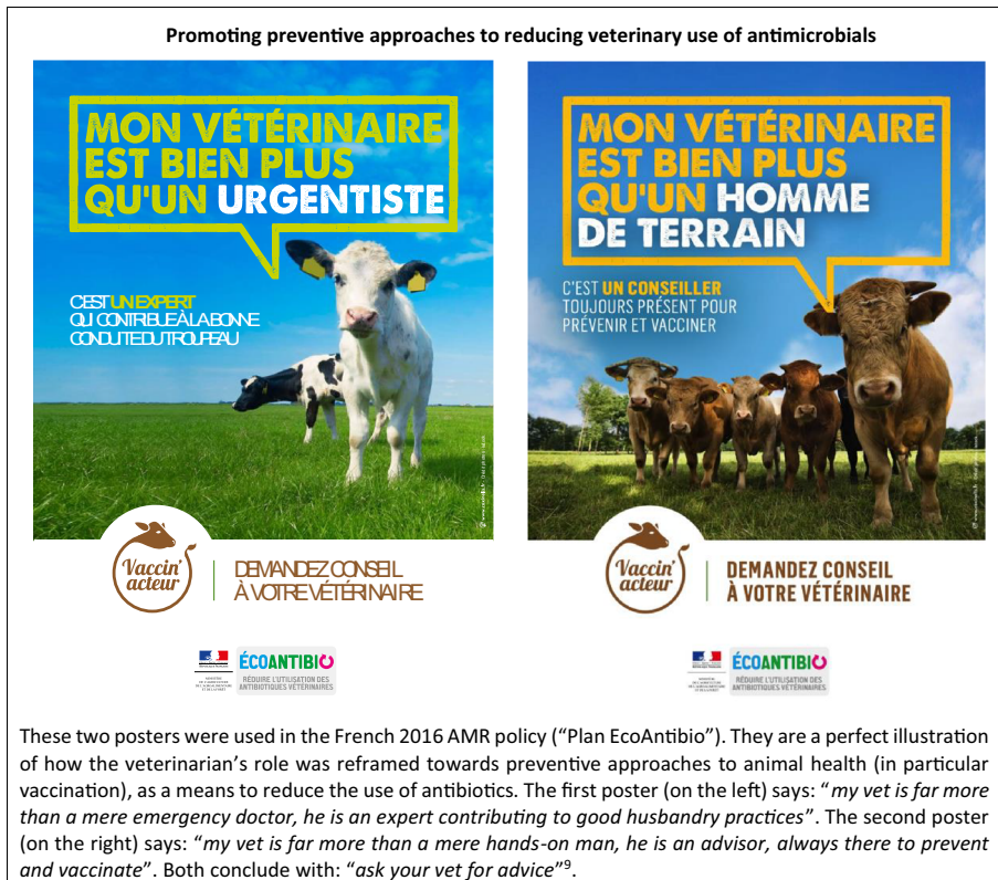
Fig. 1 Promoting preventive approaches to reduce veterinary use of antimicrobials

in hand with an economic model where the incomes of veterinary businesses would be more diversified since these new “health advisors” would be able to monetize a wider range of goods and services (hygiene and nutrition products, bacteriological analyses, livestock audits, etc.) than just pharmaceuticals.