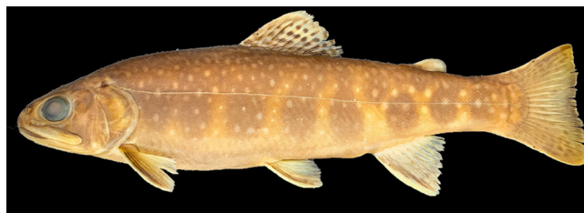
Figure 1. – Salvelinus fontinalis (Mitchill, 1814): neotype PSU 11387, Connetquot River, Connetquot River State Park, Long Island, New York, USA, 40°47.1714'N, 73°10.1134'W; credit photo J.R. Stauffer Jr. PSU.

Salvelinus multidentatus Stauffer, 2020: 8, Figs 4d, 6d, 7 (type locality: Indian Camp Creek, Pigeon / French Broad drainage, Great Smoky Mountains National Park, Haywood County, Tennessee State, USA, 35°45'56"N, 83°15'14"W; holotype: PSU 13089; paratypes: PSU 11391).