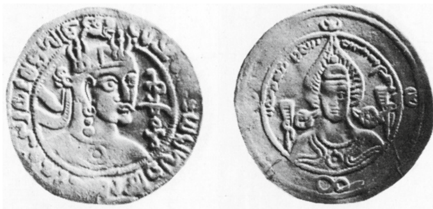
FIGURE 3.3 Tegin Khwarāsān shāh (c. 680–737)