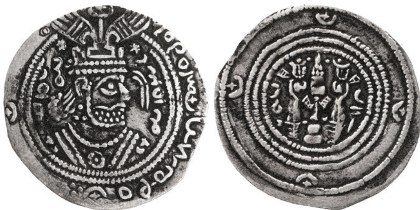
FIGURE 3.1 Frum Kēsār (737–745): a) copied on Khosrow II; b) 'genuine' portrait

some it was in c. 760, shortly after the reign of Frum Kēsār's son; according to others, it was one century later. 6 Frum Kēsār's personal name has not been transmitted on his coins or by Chinese sources.