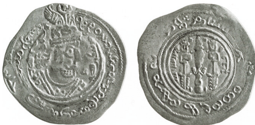
FIGURE 3.2 Coin of Khosrow II countermarked in the margin by Frum Kēsar

Nicholas Sims-Williams, having improved and completed the decipherment of coin legends by Humbach from new specimens, has shown that Frum Kēsar had countermarked some Sasanian or Arabo-Sasanian coins by inscribing in their margins a proclamation in Bactrian: 'Frum Kēsar, the lord, the prince, who smote the Arabs and thereby saved prosperity' (Figure 3.2). The translation 'prosperity' for the pair of nouns sarbo sabato (* čarv-čavat ) literally 'fat and fatness', is hypothetical but highly probable in view of Persian čarb ō čarbiš which has the same meaning.