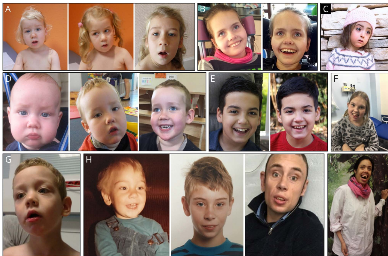
Faces of patients with pathogenic PURA variants. Recurrent similarities include a myopathic face, high anterior hairline, almond-shaped palpebral fissures, and full cheeks. A flat nasal bridge with a wide and triangular nasal tip, thickened nostrils, a well-defined philtrum, heavy eyebrows, and periorbital fullness was seen in a subset of individuals. PURA = purine-rich element-binding protein A.

the 37 patients (18.9%), respectively. Four children (10.8%) presented with an excessive activation of the epileptic abnormalities during sleep (resembling an electrical status epilepticus during sleep [ESES] pattern), whereas hypsarrhythmia and burst suppression were observed in 3 patients (8.1%) each (Figure 2).