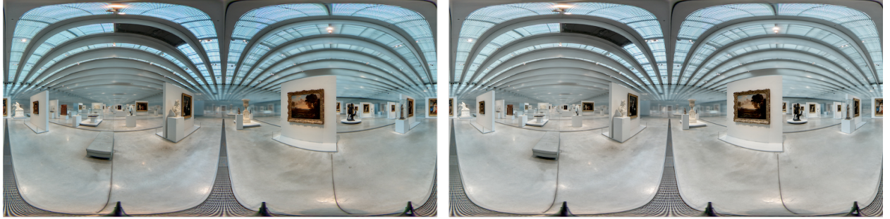
Figure 3: Application of two different tone-mapping operators on the same HDR reference (Reinhard TMO on the left image and Durand TMO on the right one).