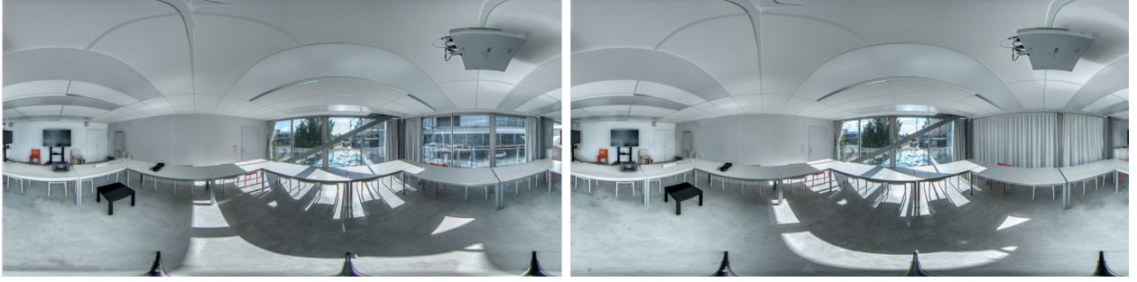
Figure 5: 360° HDR images of a classroom for different lighting conditions.

deliver two different luminous atmospheres. "Galerie du temps" is a clear large area with zenithal lighting. The walls are coated with an aluminum skin leading to a fuzzy, blurry, and ethereal atmosphere. "Pavillon de verre" is a smaller area with a very large glazed window leading to a more contrasted atmosphere. Figures ?? and 4 shows the scenes captures in the "Galerie du temps" and in the "Pavillon de verre" respectively.