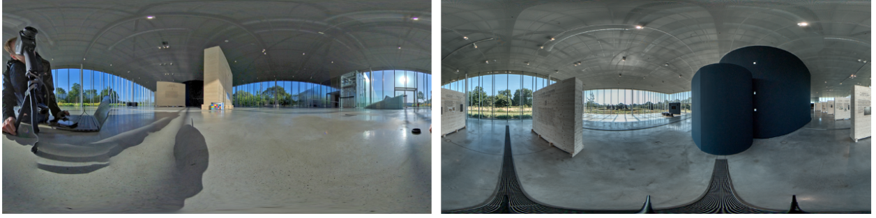
Figure 4: 360° HDR images of "Le Pavillon de verre", Louvre-Lens, SANAA. On the left, colorimetric calibration; on the right, one final capture for a specific viewpoint.