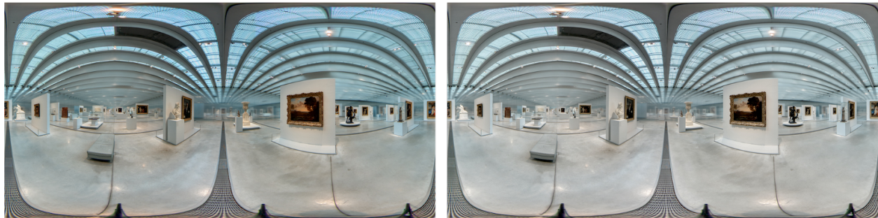
Figure 3: Application of two different tone-mapping operators on the same HDR reference (Reinhard TMO on the left image and Durand TMO on the right one).