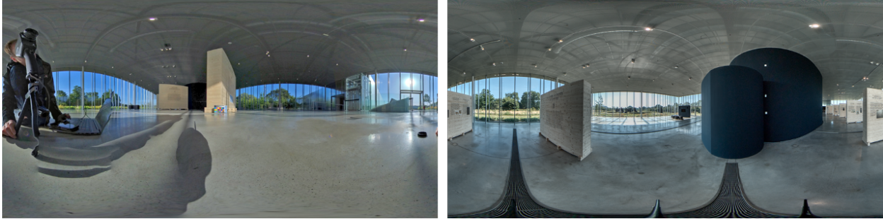
Figure 4: 360° HDR images of "Le Pavillon de verre", Louvre-Lens, SANAA. On the left, colorimetric calibration; on the right, one final capture for a specific viewpoint.