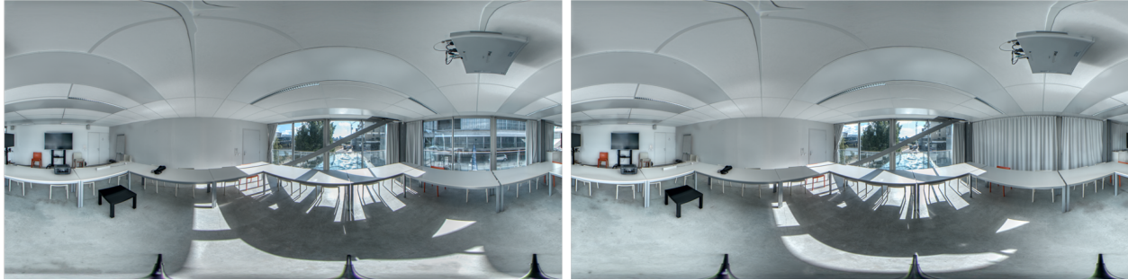
Figure 5: 360° HDR images of a classroom for different lighting conditions.

deliver two different luminous atmospheres. "Galerie du temps" is a clear large area with zenithal lighting. The walls are coated with an aluminum skin leading to a fuzzy, blurry, and ethereal atmosphere. "Pavillon de verre" is a smaller area with a very large glazed window leading to a more contrasted atmosphere. Figures ?? and 4 shows the scenes captures in the "Galerie du temps" and in the "Pavillon de verre" respectively.