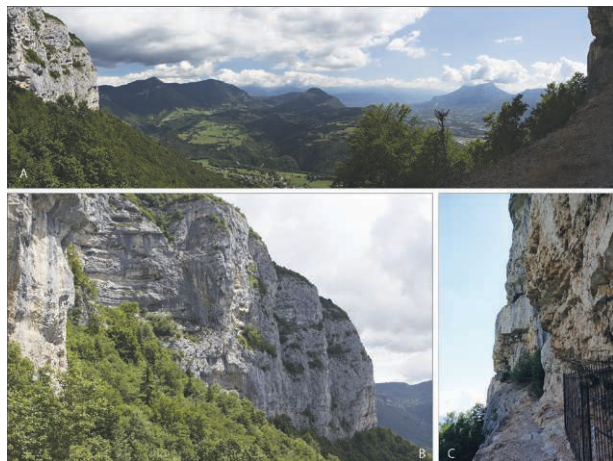
2. Environment of the site. A. View from the site. B. View of the Peney cliff to the east. C. View of the shelf with the site protected by a grid.

The Trou de la Féclaz site is located at 1140 m.a.s.l. in the south of the Bauges mountains in the inferior part of the urgonian limestone cliff of the Peney mount (1356 m.a.s.l.; fig. 2). It overlooks the Leysse plateau, the access to the heart of the Bauges mountains, the Chambéry basin and the Savoy valley. The name of the site comes from the closeness of a steep and narrow passing in the cliff wall to the Féclaz plateau.