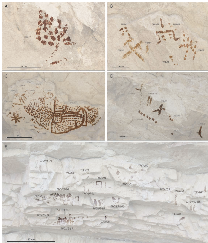
4. Examples of tracings of the rock paintings from the Trou de la Féclaz site (tracings: C. Defrasne).