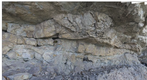
3. View of the painted rockshelter.

The rockshelter, facing south-east (130°) and located on a 2,50 m wide rocky shelf and a hundred meters long, is shallow and constituted of a series of spalling rock strata (fig. 3). Paintings have been identified on both vertical and horizontal surfaces of two strata over a length of 5 m. The Trou de la Féclaz site is one of the two sites with schematic rock paintings in Savoy and one of the northernmost of this schematic corpus. A small cave is located at the end of the shelf, at 15 m of the painted rockshelter. The Trou de la Féclaz site differs from most of the others sites by the number and good preservation of the paintings and the diversity of the used coloring matters.