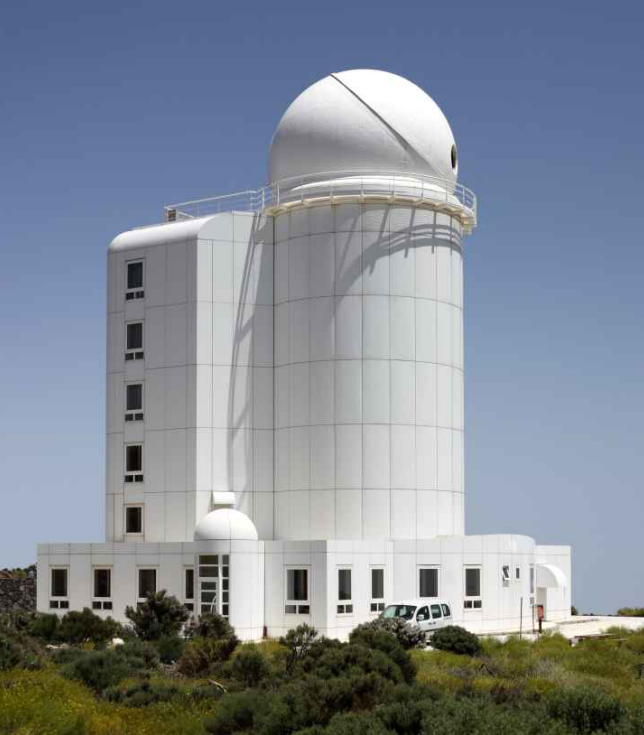
Themis solar telescope Tenerife, Canaria Islands Ø 90 cm, altitude 2400 m