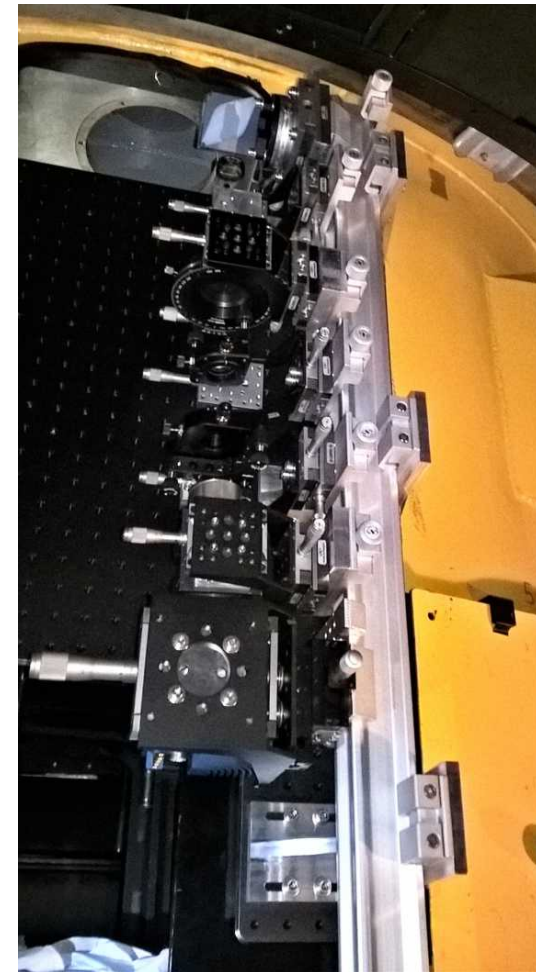
Wavefront sensor at the telescope