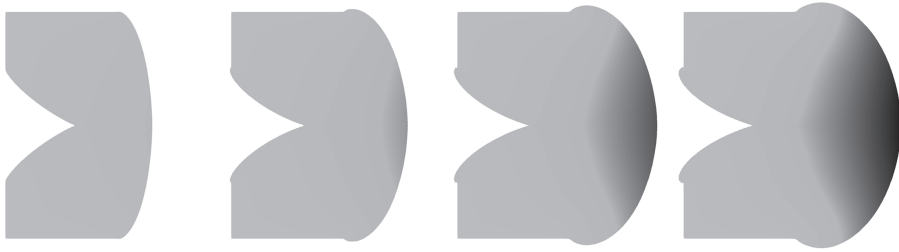
FIG. 3. Crack problem. The deformed domain for different force magnitudes f = 0.25, 0.5, 0.75, 1 (from left to right) pulling the right face of the computational domain. The gray scale describes the magnitude of the displacement |\mathbf{u}| , where white corresponds to 0 and black to 0.92.

the solution (\mathbf{u}, \mathbf{T}) \in \mathbb{X} \times \mathbb{M} is defined as the one satisfying