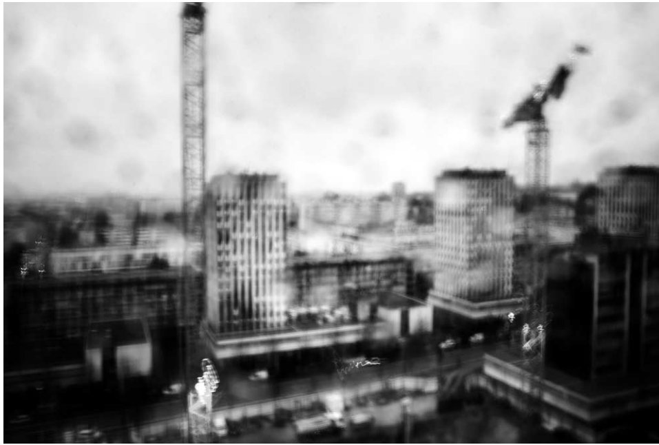
Figure 2: (Author, 2017)

as an anthropological field researcher as well. I experienced, observed, and photographed. These three practices introduced me to the dwellers, the institutions, and, importantly, the moral ecology (Hannerz 1983) that organizes visual interactions in this social space. Based on this experience, I began to question photographic practices that take place in the field. I aimed at examining the ways photography could be used as a critical and reflexive medium to interrogate the ways the city dwellers themselves came up with their own representations of their environment. Based on a series of multimodal ethnographic examples, my research analyzed both the pragmatic dimension of visual interactions and the phenomenology of the visual experiences which took place during my fieldwork.