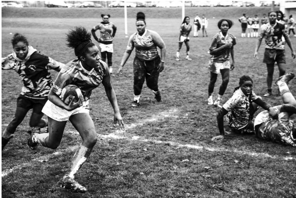
Figure 9:

For example, one element that was regularly highlighted by the participants was gender inequality. In the introductory passage of this article, Assa mentioned that she wanted to be shown as someone strong, proud, and committed. Engaged in a sport often perceived as “too masculine” or “too violent” for girls, rugby was for most of these