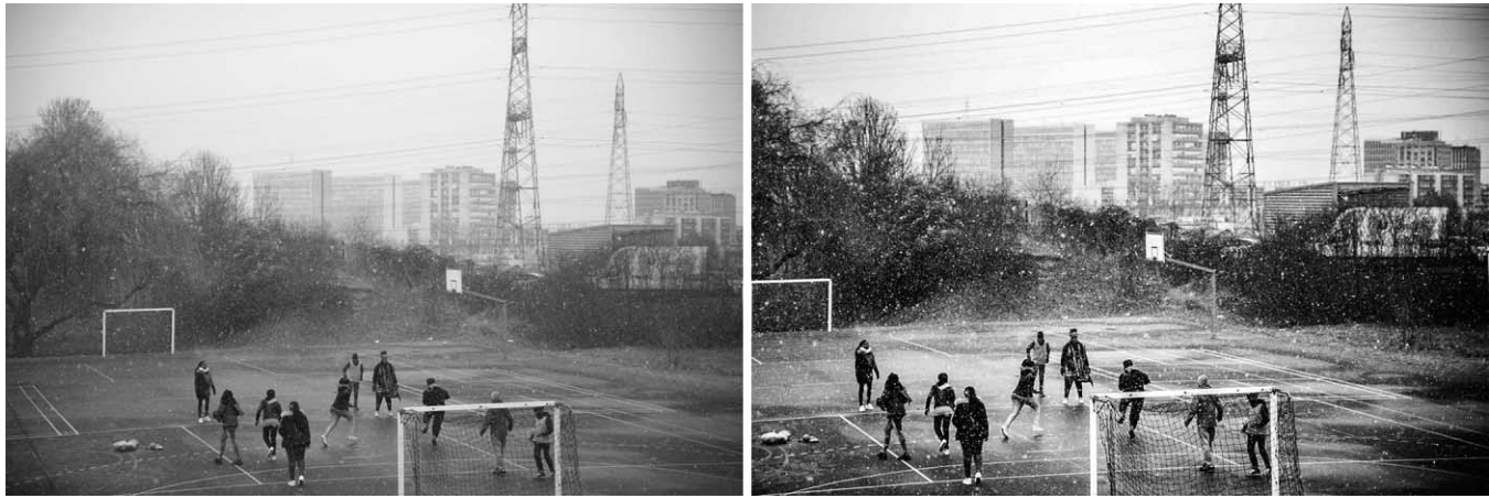
Figure 7: A training session in the high school. The original is a color photograph, taken by the author.

snow start falling. I made a series of pictures. I wanted to take advantage of the snow to bring out the atmosphere and thermal sensation during the training session. I shot the scene with a long focal length (70mm) adding an external flash to highlight the snowflakes.