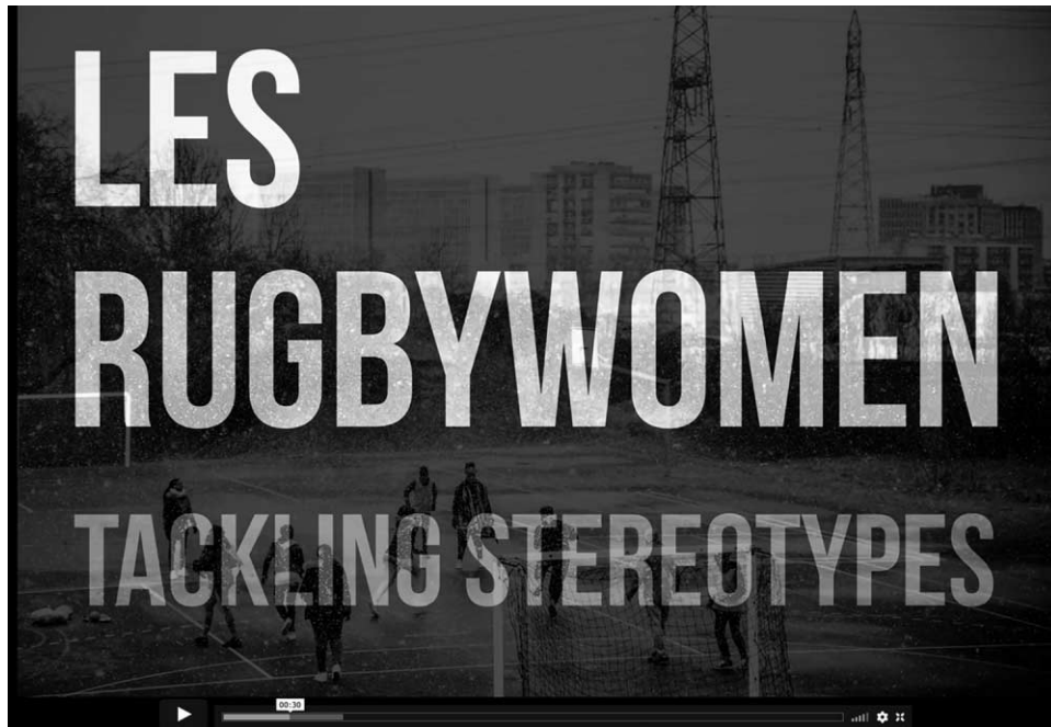
Figure 11: Screenshot of Les Rugbywomen sound slideshow (4 min). Available online: https://vimeo.com/258468083 .

The visual narrative we produced highlights the women's physical investment in sports and describes the heterogeneity of the social world in which this practice takes place. As I said before, the visual and moral engagement of the narrative is tightly tied to the dialogues and interaction I had with the rugby players. There is one activity that particularly shaped the participatory construction of the photographic narratives: sound recording. Throughout the fieldwork a group of rugbywomen took part in the production of audio recordings. Following Rouch's experiences in ethnographic filmmaking, I instructed the participants how to record (Rouch 1979: 61). In particular, they recorded a series of soundscapes. The recordings, as testimonies and informal interviews we had, directed me to discover the intimate dimensions of social interactions among the young women. Sound recordings and, on a larger scale, the ethnographic encounters improved my understanding of a series of plastic and iconic representational elements during the photographic documentary process. Afterwards some of these recordings were used in the creation of Les Rugbywomen sound-slideshow.