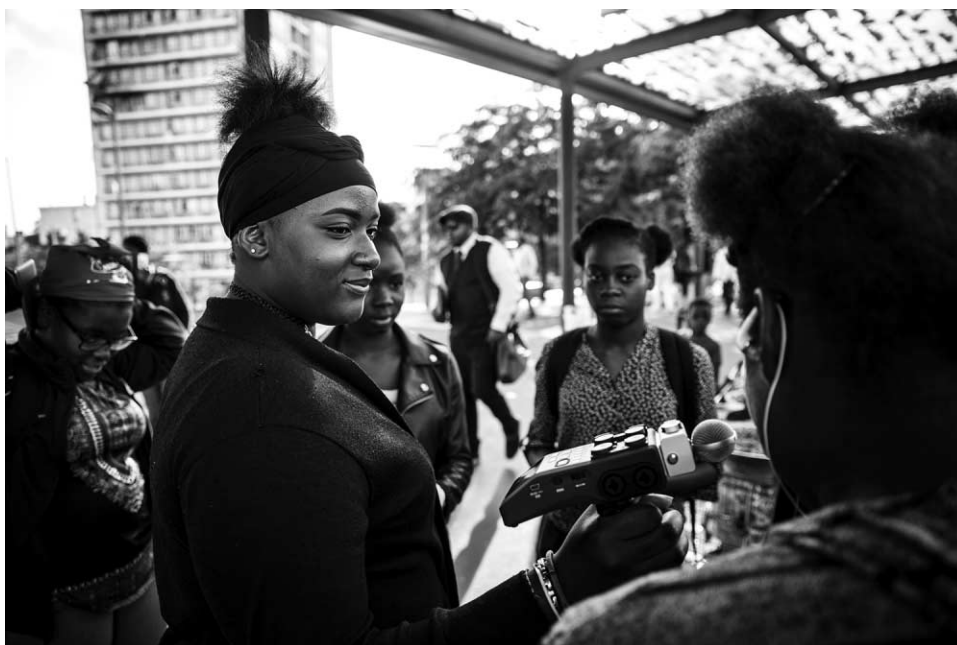
Figure 10: (Author, 2017)

young women a way to improve their self-confidence and sense of strength. Many of the editorial and postproduction decisions made were based on this double feedback. On the one hand, I had the feedback from experiences in the field. On the other, I had input from the dialogues, interviews, and collective editing we did with the players.