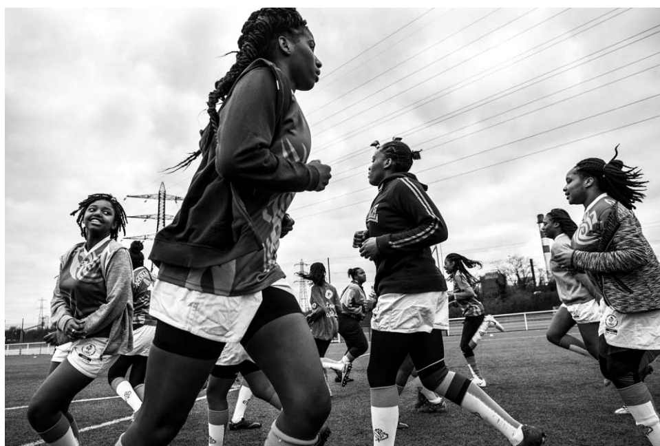
Figure 1: (Author, 2017)

Keywords: photography, ethnography, visual anthropology, materiality, banlieue, urban ethnography