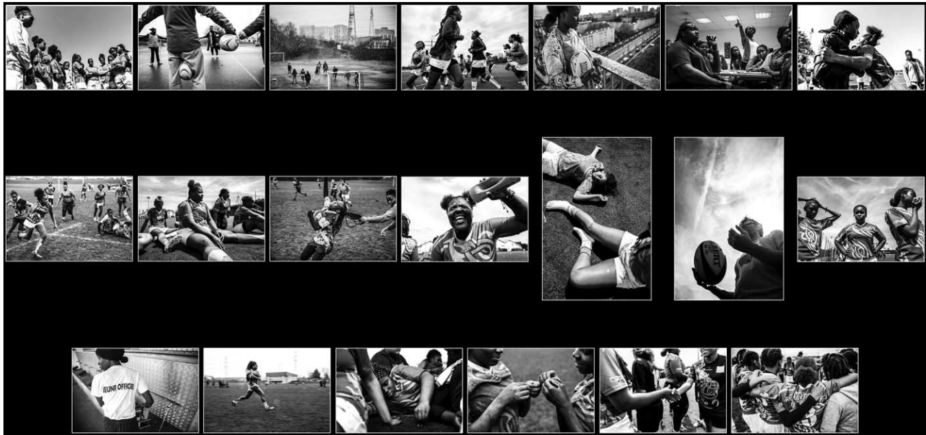
Figure 14: Editing of the exhibited photographs. Work by the author.

Following Dewey (1927), Cefaï describes publicity in an “ecological and processual” way (Cefaï 2018). I considered the sharing of photographic materials as a mechanism to understand the visual ecology of the social image of the studied community.