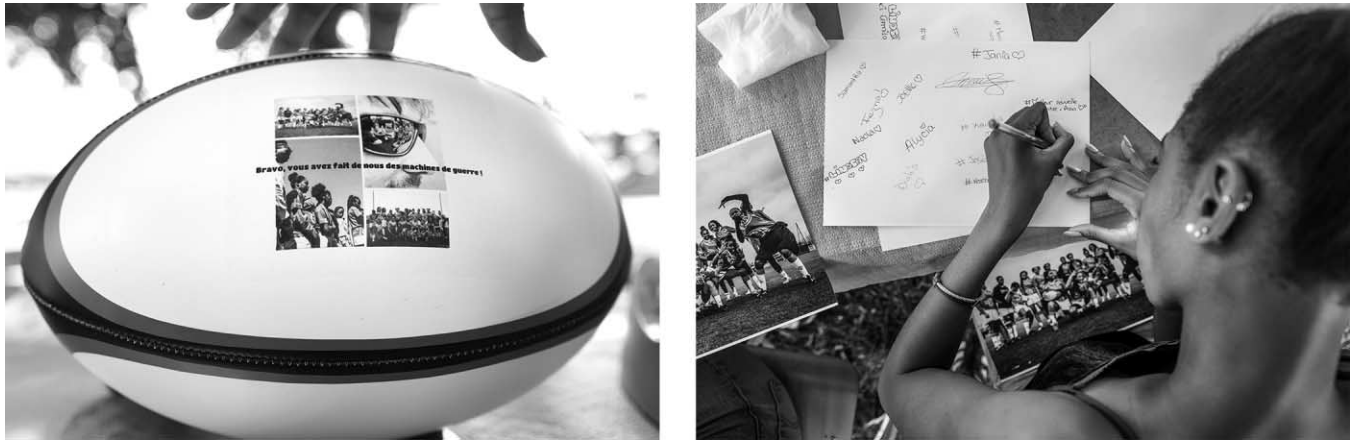
Figure 17: On the left: the personalized rugby ball offered to the coach. On the right: Fatime signs the printed photograph of Assa.

performative activities, following the path of anthropologists who use photography in experimental and creative ways (Desjarlais 2019).