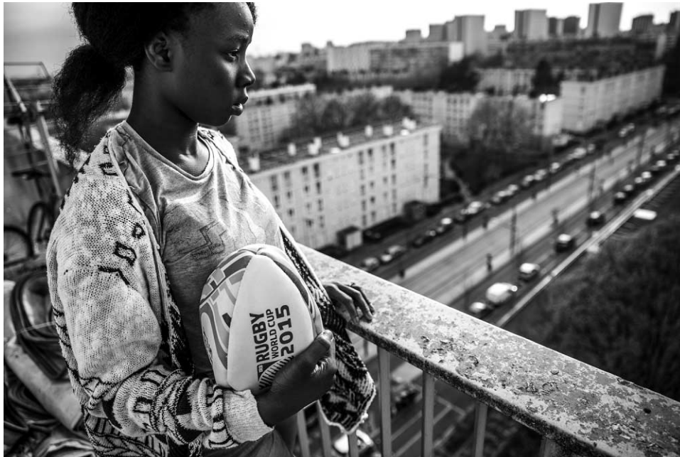
Figure 5: (Author, 2017)

from the place and rugby was a means to pursue her professional project and to get out of town.