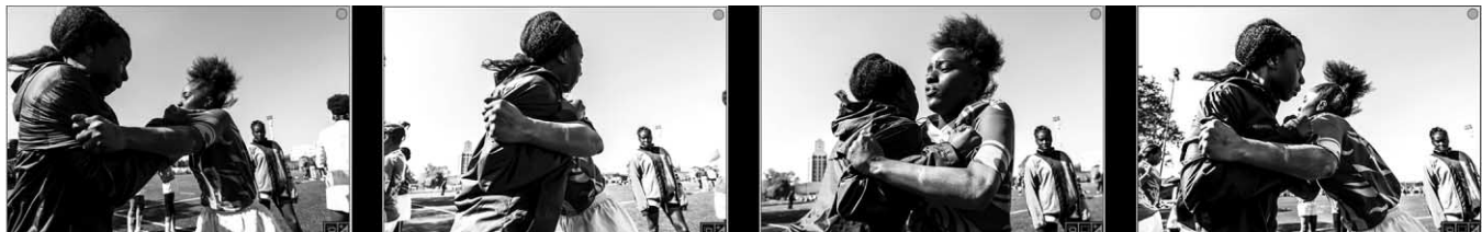
Figure 13: In this quick sequence, four photographs enhance the sense of movement.

Making the visual narratives public is a crucial stage in the social life of ethnographic photographs. For instance, Daniel Cefaï has distinguished two major ways of thinking about publicity ( publicité ): the first is located in a discursive paradigm inspired by the Habermasian theories of public space (Habermas 1978). The second one alludes to an ecological and pragmatic conception of publicity.