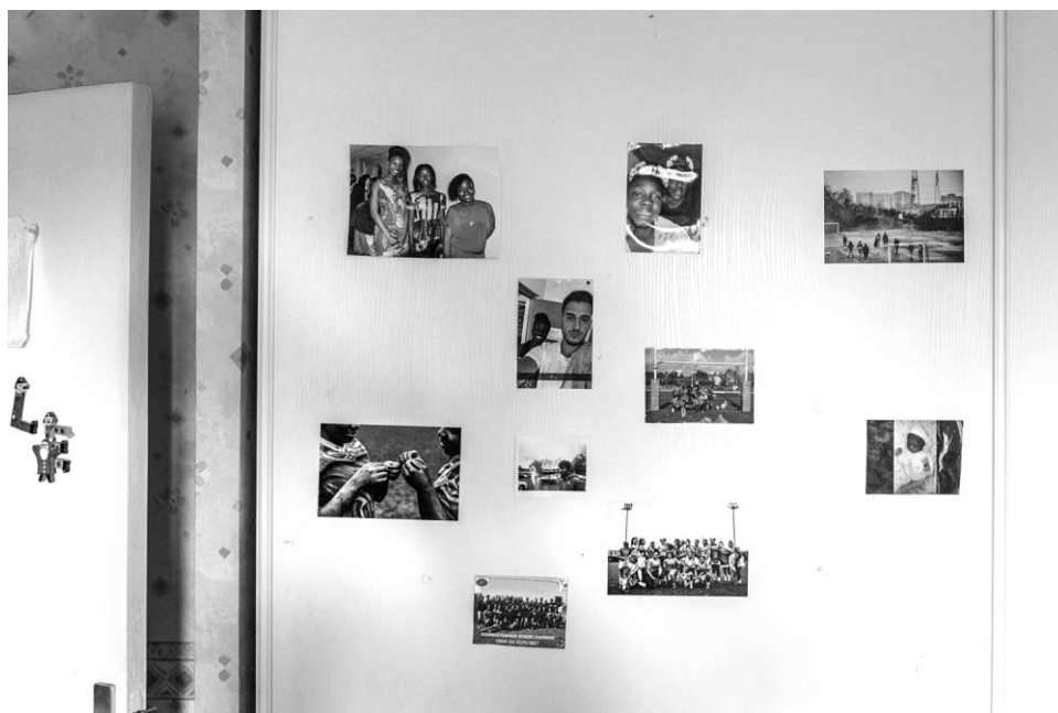
Figure 18: Prints on the wall of Koumba's room.

Reflexive practices, participant feedback, the right social environment, and the right visual materials make ethnographic photographs happen. The way in which photographs are built relies firstly on the senses, secondly on editorial practices. In that sense, a performative photograph is a poetic, reflexive, and plastic response to a social sharing between the ethnographer and the social environment.