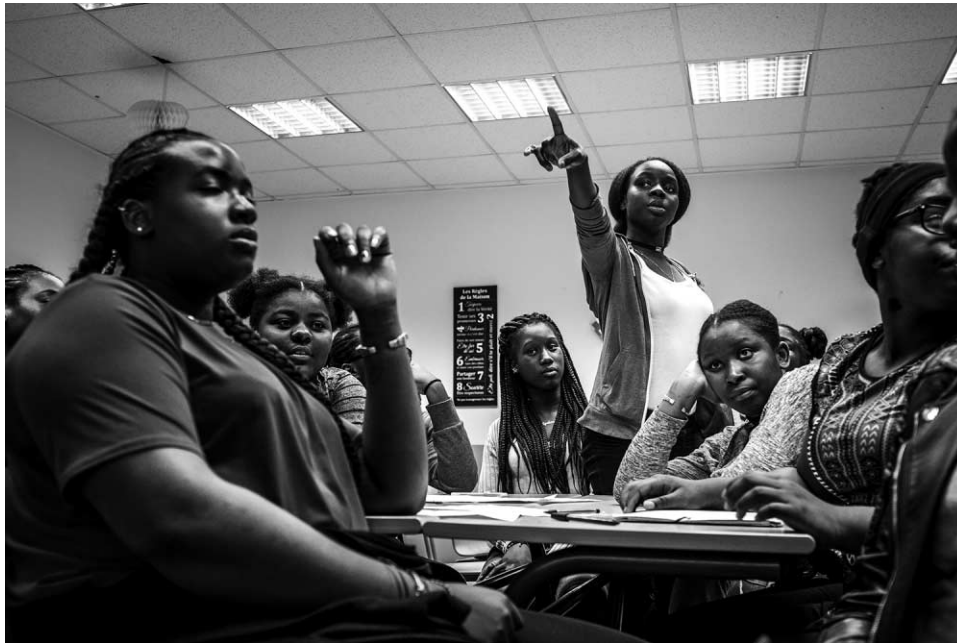
Figure 8: (Author, 2017)

inside but also to contest the hegemonic forms of representation of sportswomen revealed by Duncan. In this specific case, the creation, postproduction, and exhibition of black-and-white photographs highlighted a sensory and reflexive reality experienced in the field. A different visual approach (i.e., by photographing in film, using telephoto lenses, or portraying from “below eye-level”), would lead to a distanced and detached visual message that could not do justice to the ethnographic encounter.