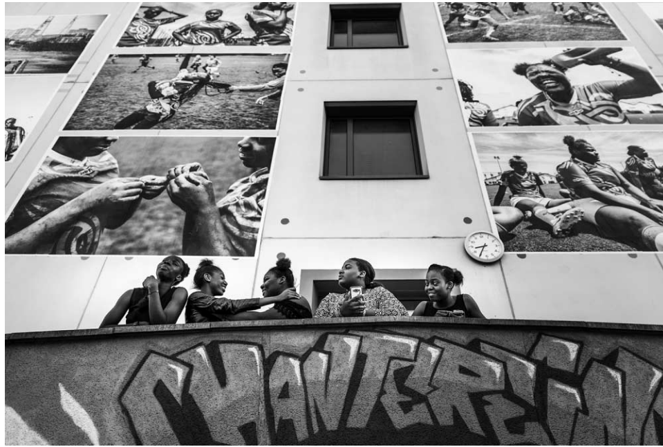
Figure 16: (Author, 2017)

A second event reveals how participants may materially reclaim photographs to communicate personal and inner experiences. During their last encounter 32 the coach handed out 20 × 30 cm printed photographs of the team as souvenirs (Figure 17). Unexpectedly, players started to write verbal messages behind the prints of each other. These objects became new material supports of creative communication and memory. For most of them, these prints became a physical reminder of the collective experience of being part of the Chantereine team (Figure 18).