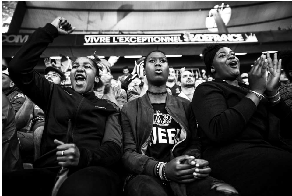
Figure 4: (Author, 2017)

had followed the activities of the rugby players from the high school. 12 I regularly attended the training, tournaments, and informal meetings. In particular, I had photographed a group of five players. I was interested in discovering the relationship between rugby and the urban experiences of the young Sarcelloises. Upon receiving the coach's invitation, we decided that I would document the activities of the team while creating visual materials to showcase the sports activity to a broader audience.