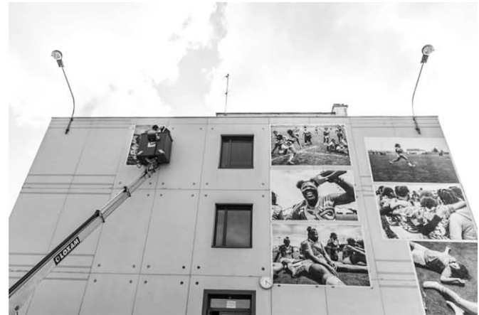
Figure 15: Installation of Les Rugbywomen exhibition in the Chantereine high school. June 1, 2017.