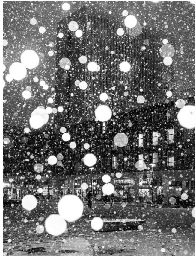
Figure 3: (Author, 2017)

Indexicality has shaped early theorizations of photography in visual anthropology. 7 This is even more noticeable in visual sociology, a field in which photography has been used as extensively as film. Photography has been traditionally conceived of as a way of capturing visual pieces of evidence. For instance, Howard Becker claimed that photographs “show us real instances of what the text talks about, with enough detail about the specific people and places we are looking at to let us make more or other interpretations” (2002: 11). Studying urban spaces,