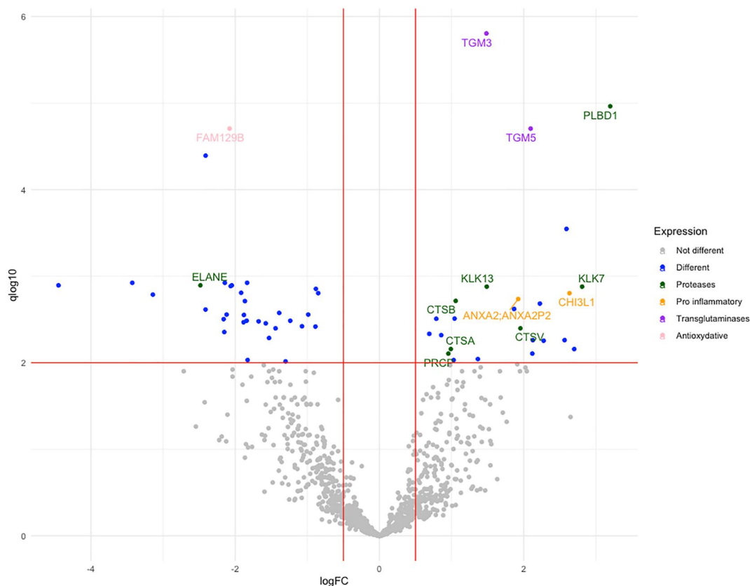
FIGURE 1 Volcano plot of differentially expressed proteins between patients with cystic Fibrosis (CF) (patients with CF (pwCF)) and non-CF individuals (WT). Thresholds of 0.5 for log 2 Fold Change (FC) in abscissa, and of 0.01 for q values (expressed as -log 10 ) in ordinate, are used for significancy and plotted in green. Differentially expressed proteins are plotted in colour (Proteases: green; proinflammatory proteins: orange; transglutaminases: purple; antioxydative proteins: pink; others: blue)

13, Phospholipase B domain containing 1, Cathepsin A L2 and B, Lysosomal Pro-X carboxypeptidase, neuraminidase); (ii) proinflammatory proteins (Annexin A2, Chitinase-3-like protein 1); (iii) cytochrome c; (iv) Transglutaminases 3 and 5; and (v) Toll-interacting protein (TOLLIP). This contrasted with decrease of Elastase 2, an epidermal protease, FAM129 B, an antioxydative protein and Desmoglein-3. Finally, 2 proteins known to interfere with CFTR biology were underexpressed (Sodium-hydrogen antiporter 3 regulator 1 [NHERF1] and Solute Carrier Family 6 Member 14, SLC6A14).