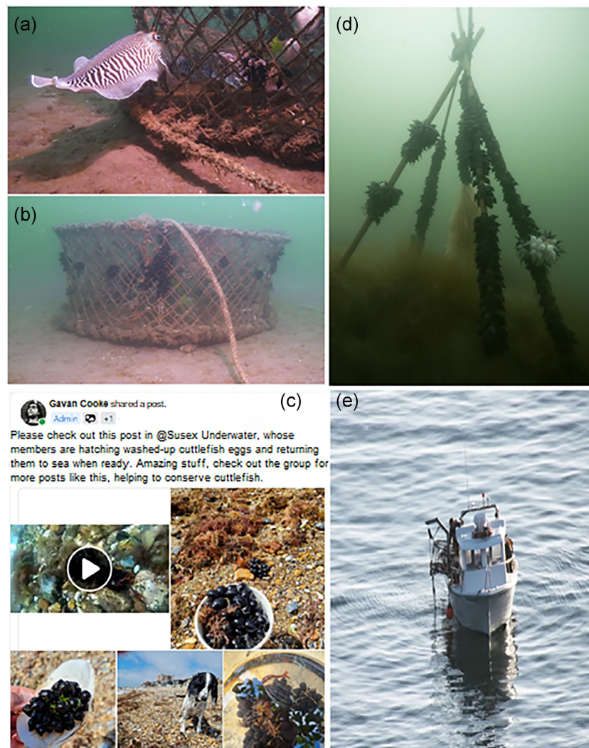
Figure 6. (a) Citizen science has provided in situ recordings of cuttlefish breeding behaviour regarding egg laying on fishers' traps and (b) willing participants can provide year-round observations of egg development if traps are left in place, providing positive feedback to fishers who engage in sustainable practices. (c) Members of the Facebook groups (such as "UK cephalopod reports") are assisting in hatching cuttlefish eggs that wash up on the shore. (d) SCUBA dive groups are taking matters into their own hands by building artificial structures for cuttlefish egg laying that appear to be successful and benefit other cephalopod species, e.g. squid (eggs laid, below centre). (e) Citizen scientists may also provide evidence of where fishers engage in unsustainable practices, such as washing off eggs before landing.

some SCUBA divers have assembled semi-permanent, artificial (using natural materials such as bamboo) egg-laying sites (Figure 6), which have proved successful at attracting eggs but may potentially infringe on local maritime laws.