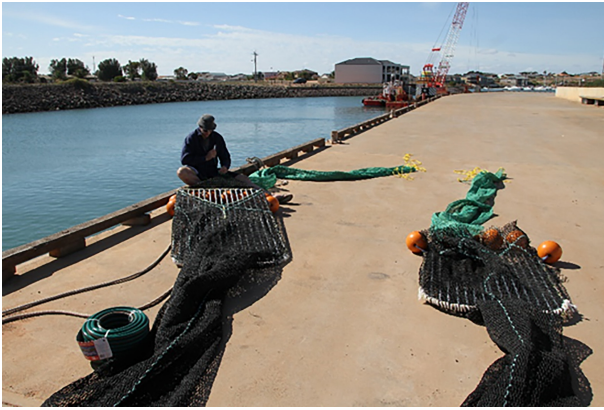
Figure 1. Nordmøre-grids designed to reduce bycatches of cuttlefish in penaeid trawls being assembled on a quayside.

speed of \sim 1.9 \text{ m s}^{-1} (Kennelly and Broadhurst, 2014; Noell et al. , 2018).