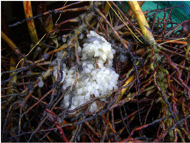
Figure 4. A fish aggregating device (FAD) constructed of casuarina branches with cuttlefish eggs attached.