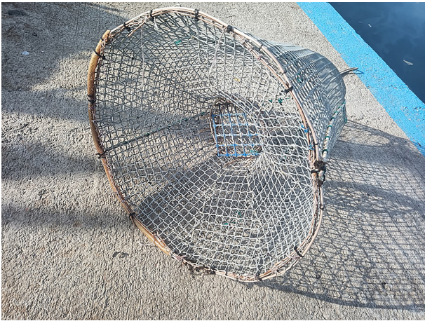
Figure 5. A closed basket trap which, in-situ , would prevent unnecessary cuttlefish deaths or ghost fishing mortality.

that existing indirect management measures (such as the octopus fisheries measures) may not be enough to curb the overexploitation status and that more direct management measures, such as a specific cuttlefish quota, and, as we suggest, further research into gear selectivity and an improved understanding of regional cuttlefish mortality, are essential for species recovery.