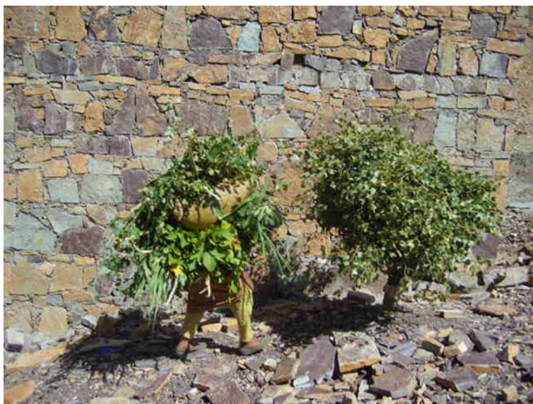
Plate 3 Cattle fodder collected from the terraces in El Maghzen.