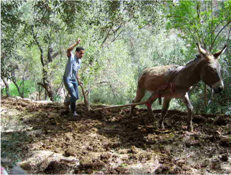
Plate 2 Ploughing with donkey on terraces in El Maghzen.

of the animal and a certain amount of strength to push the axle of the mill. The collection of wood is either a female or male activity, in which a group of young children team up for the task, loading the donkeys and mules with chopped wood before returning to the village at dusk.