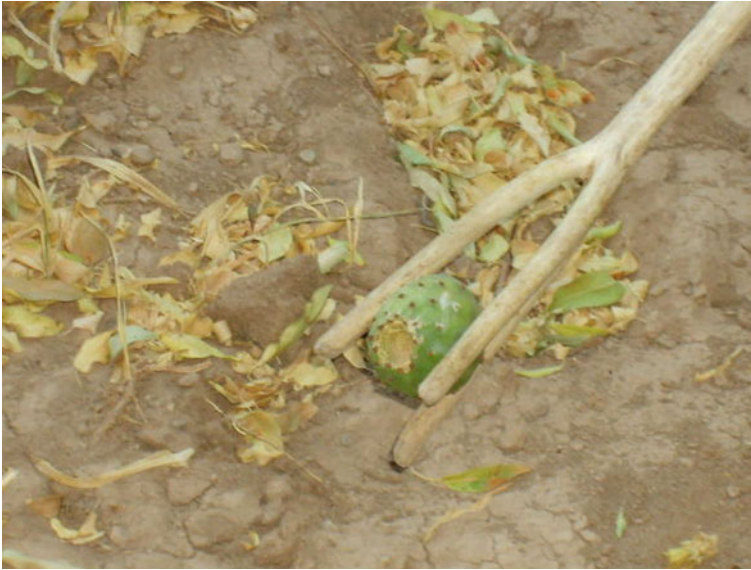
Plate 4 A special hand made tool for handling the prickly Barbary fig.