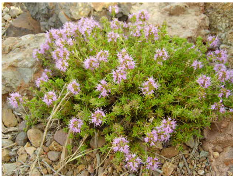
Plate 5 Azoukni ( Thymus satureioides ).