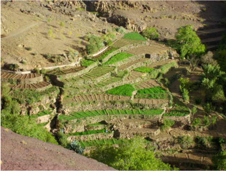
Plate 1 A typical landscape of wheat terraces in the Agoundis valley.

the landscape according to their needs. Gardens, not only provide the basic crops to feed the family, but also a space for recreational and other social activity, and where, for example, women can make pre-arrangements for meetings. In the spring and summer, people will spend a considerable amount of time in the garden and have food and tea brought to them by a younger member of the family. Every household has a more or less equal number of terraces and due to the restricted space for cultivation, the gardens are well-delineated, ploughed with a mule and wooden plough. Nothing is added to the land apart from cow and chicken manure once a year.