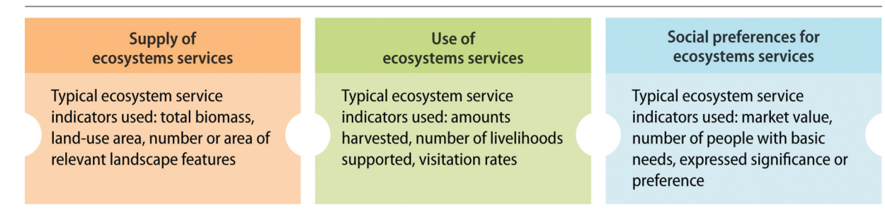
Figure 2. Ecosystem services indicators represent different aspects of the relationship between people and their environment.