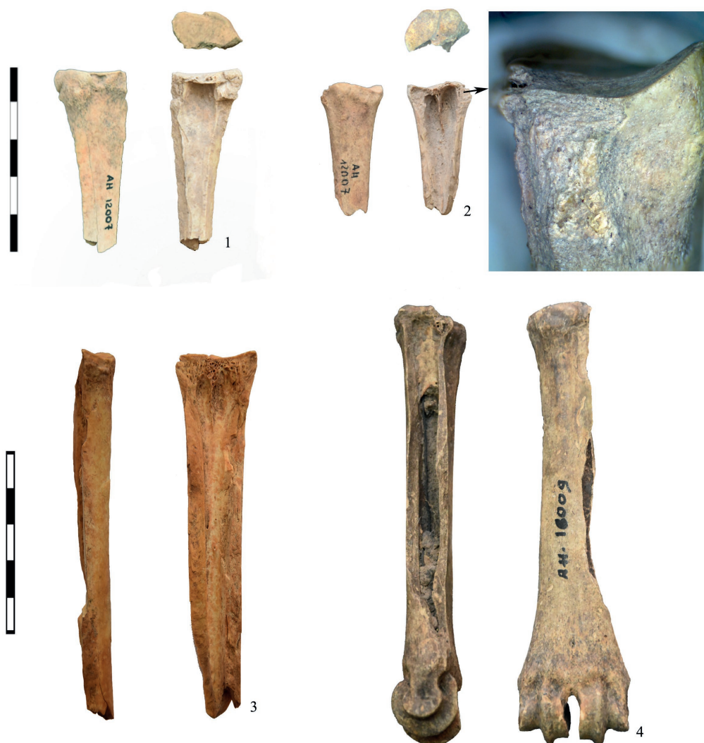
Fig. 4. Wastes linked to the debitage scheme by bipartitioning showing characteristic technical stigmata of longitudinal indirect percussion.

The presence of impact points associated with fracture planes are identified on the long bones of large, medium and small-sized mammals. The association of taxonomic, technical and taphonomic data allows a more precise characterisation of this debitage method, highlighting repeated forms of debitage operations. The impact points can be single or double, often inflicted just below the epiphysis (metapodials) or along the medial section (humerus and femur). The percussion is rarely performed on an anvil, attested by a single piece where backlash was identified.