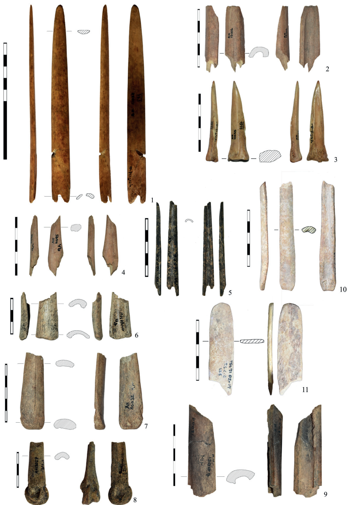
Fig. 2 . Tools obtained from a debitage scheme by bipartitioning: smoother (1), bevelled object (2), awls (3-5) and indeterminate tools (6-9) from Tepe Abdul Hosein; a smoother (10) and an indeterminate object from Tappeh Sang-e Chakhmaq.