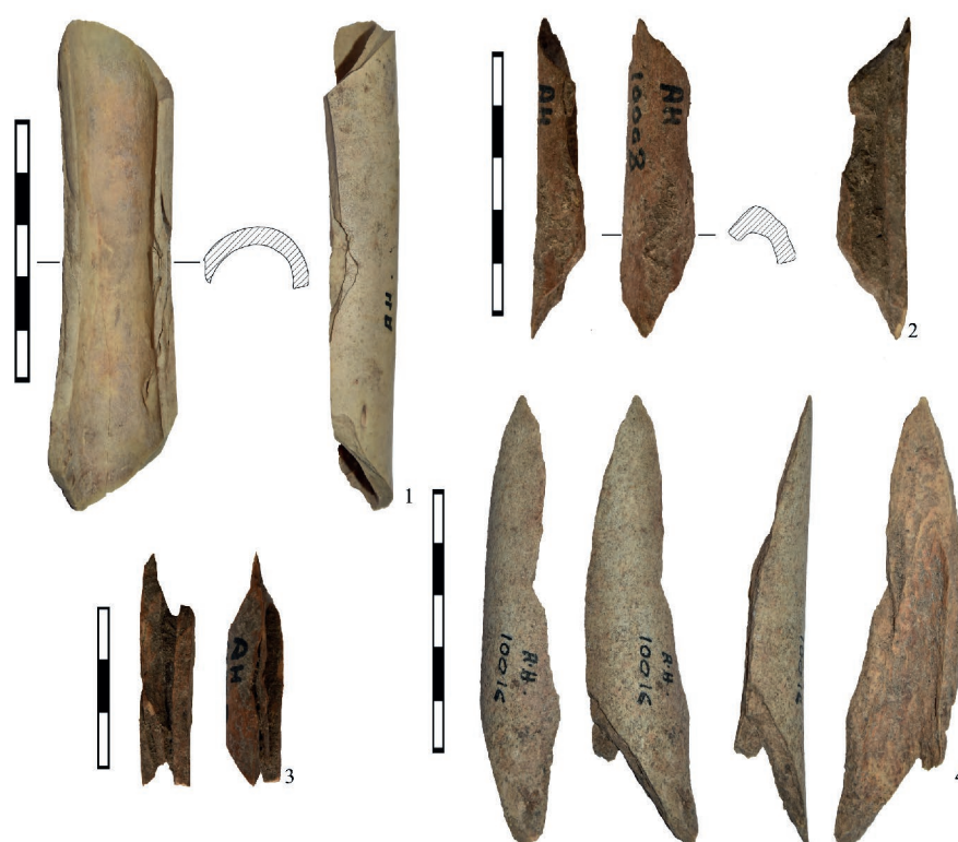
Fig. 7. Wastes linked to the debitage scheme by fracturation showing characteristic technical stigmata of direct percussion.