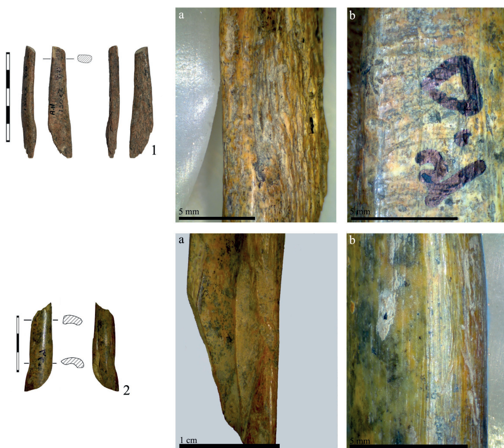
Fig. 6. Technical stigmata identified on the surfaces of tools: direct percussion (1a and 2a) realised during debitage steps; abrasion (1b) and longitudinal scraping (2b) applied during shaping phases.

Only one potential rough-out was identified. It is a bone splinter, obtained from the long bone of an ovicaprid, which started to be scraped at the medial part and was subsequently abandoned before the shaping phase.