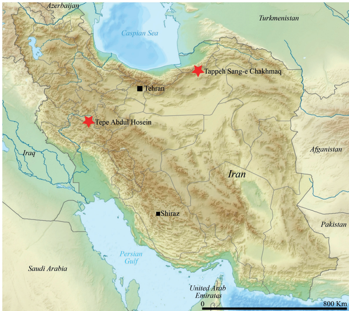
Fig. 1. Map showing the location of Tepe Abdul Hosein and Tappeh Sang-e Chakhmaq (red stars) and present-day cities (black rectangular).

the Neolithic. The first was during the pre-ceramic Neolithic period (7th millennium BC), and the second contained ceramic finds and was dated to the end of the Early Neolithic (5th millennium BC). These two phases, dated in absolute chronology (Pullar 1981; Daly et al. 2021), are stratigraphically separated by a sterile layer that indicates the abandonment of the site between the two occupation phases. The particular abundance of hard animal industry, the good preservation of the faunal finds and the good chronological framework of the techno-complex make this site one of the most promising for the characterisation of the Zagros bone industry. Several elements of material culture, such as pottery finds, clay objects, flint artefacts, and biological remains were found in the site at all levels. The faunal