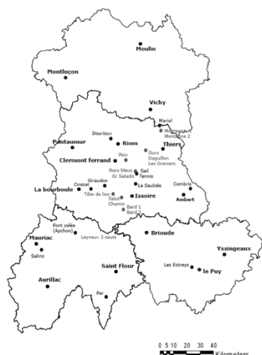
Figure 1: geographical location of the 27 springs studied by TIRAMISU multidisciplinary teams [15].

circuit (gas, rocks), and (4) to estimate potential mixing with surface water likely to alter its original properties.