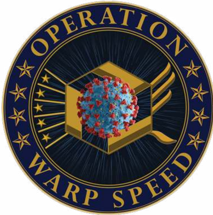
Figure 1: Official seal of Operation Warp Seed