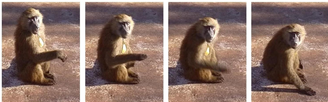
576 577 578 Fig. 1. — A young male intimidates a human observer by quickly slapping his right-hand on the 579 ground. 580 581 582