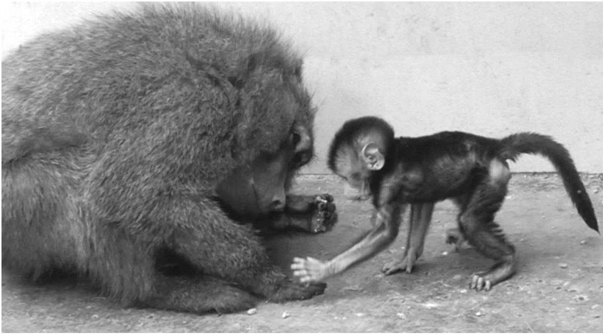
Fig. 2. — An female adult baboon tries to draw the attention of her offspring toward the piece of fruit that she waves between her fingers. This is the first time that such a “joint attention” gestural behavior has been observed in this species.