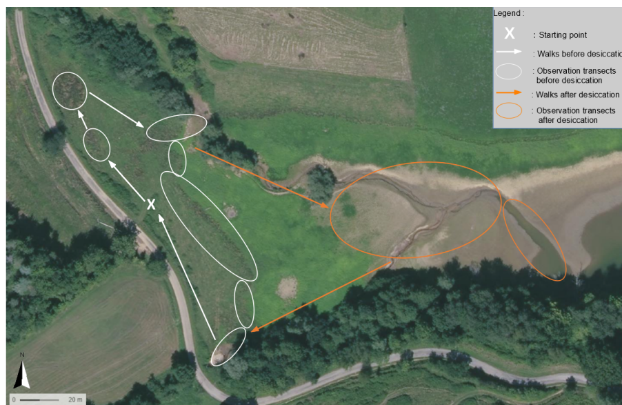
Figure 4. Map of the location of the Pollard walks in the study site. Transects are following the course of the water retreat during summer. White and orange traits indicate transect walked during the flood or the desiccation of the creek, respectively.

Adult damselflies and dragonflies were monitored by performing modified Pollard's walk [6] on the accessible parts of the study site (Figure 4). This method is widely used to estimate the relative abundance and diversity of butterflies and has been adapted to Odonata. Observation surveys are carried out along fixed transects. Adult damselflies and dragonflies were observed in a 5 m strip on both sides of the transect, while walking a slow and steady pace and their identity and numbers were recorded. The route taken between transects during each sampling session is shown in Figure 4. Routes are modified to follow the variation of the water level (Figure 4).