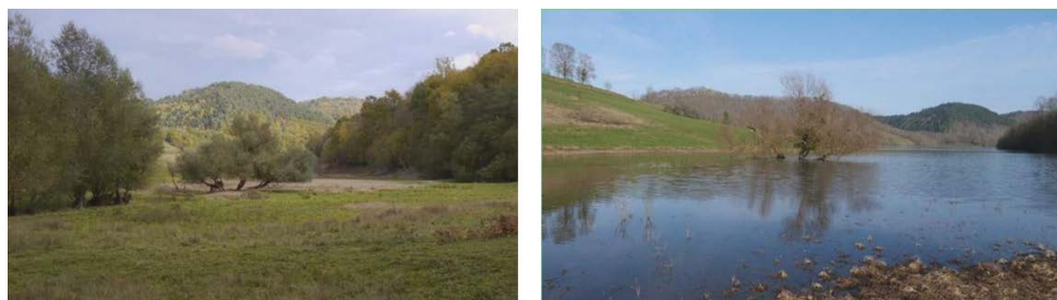
Figure 3. Emerged ( left panel) and submerged part ( right panel) of the study site showing the extent of the desiccated area between June and August.