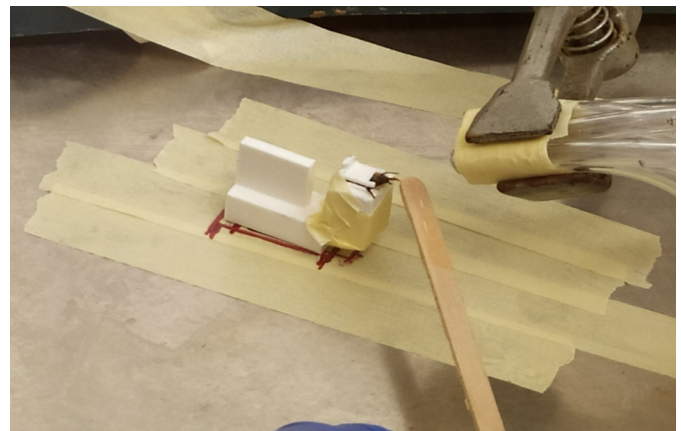
Fig. 3. Picture of the conditioning procedure during protocol 1. A single honeybee harnessed inside our custom-made bee holder. The bee has just been exposed to a positive sample and been provided with a wooden stick soaked in sugar water, which has led her to express the PER.

Throat swabs were taken of necropsied animals from a mink farm during the SARS-CoV2 epidemic in the period of April-November 2020, in the Netherlands. 2 ml of Dulbecco's Modified Eagle Medium (DMEM), supplemented with 10% Fetal Calf Serum (FCS) and 1% Antibiotic