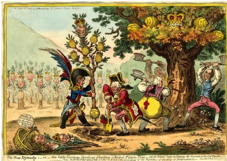
Figure 6: James Gillray, New Dynasty - or- The Little Corsican Gardiner Planting a Royal-Pippin-Tree (1807).

Napoleon was shown trying to plant an old-fashioned aristocratic tree with several medallions. The roots were tied in a bag with the inscription ‘William the Norman Robber’ and the branches carried the name of various English traitors: ‘Robert Hungerford, beheaded. 1406’ or ‘Countess of Salisbury’ decapitated in 1541 for her involvement in the catholic plot. In contrast the ‘royal oak’ was no longer linked to a dynasty. It bears instead British and constitutional emblems: monarchy, protestant faith, ‘integrity of the Lord’, ‘independence of the Commons’ and ‘liberty of the press’. Unlike the shallow-rooted Corsican pippin-trees planted on foreign soil, the royal oak had become a national sanctuary. It was in vain that the usual enemies of the State, such as Catholics, or unpatriotic Whigs, were trying to cut it down. After Waterloo, in 1815, Napoleon’s pedigree was no longer compared to a tree but to a bunch of violets growing on dungs and mushrooms, evanescent and soon to be erased from history. 22