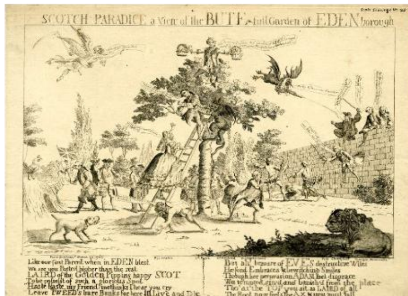
Figure 3: Edward Sumpter, Scotch Paradise a View of the Bute full Garden of Eden borough (1763).

The publication of Guthrie's and Edmondson's Peerage was met with mixed responses. Guthrie and Edmondson's publications provoked much criticism and the arboreal metaphor was used to fulfil a more subversive agenda. In the engraving The Scotch Paradise , a royal oak tree was turned by the royal favourites into a tree of corruption which John Bull was trying to put down.