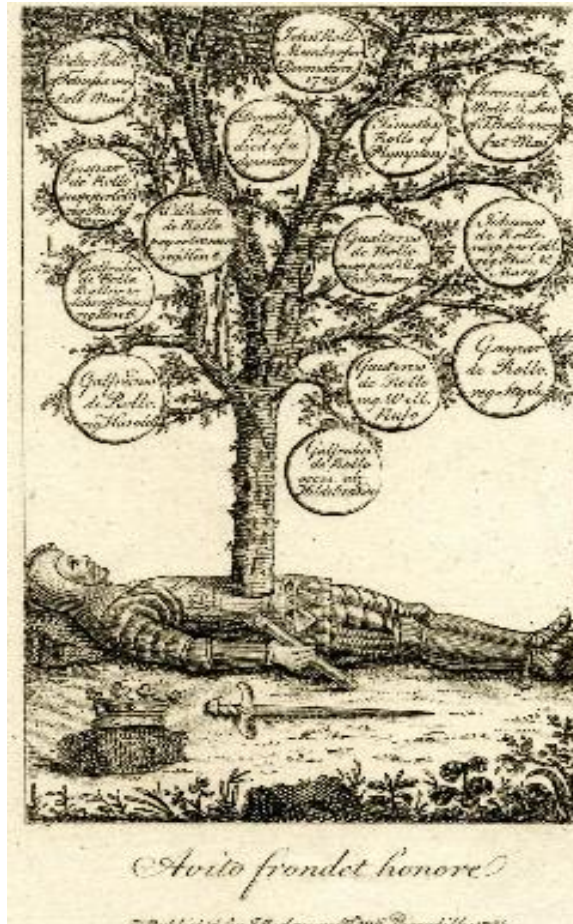
Figure 4: Avito frondet honore, 1785. 16