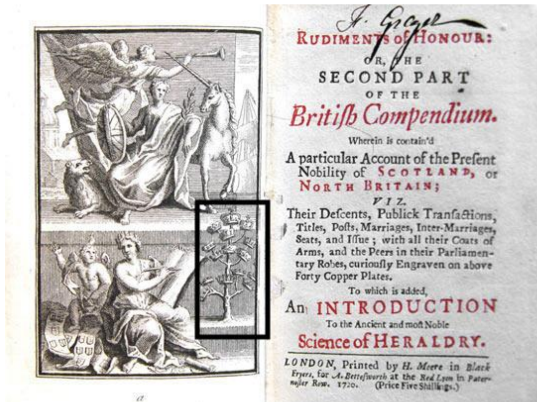
Figure 2: Francis Nichols, Rudiments of Honour or the second part of the British Compendium , 1720.