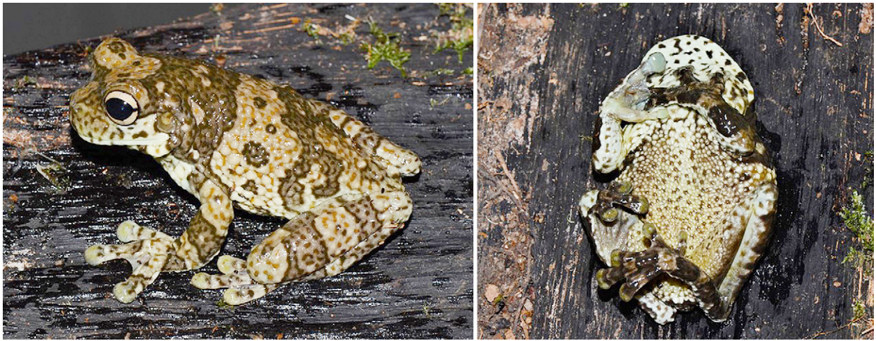
Figure 2. Live adult male of Trachycephalus hadroceps (CECC 3626; SVL 53.5 mm) from Porto Grande, state of Amapá, Brazil, in dorsolateral (left) and ventral (right) views.

Autorização e Informação em Biodiversidade (ICMBio/SISBIO permit #48102-3). In order to provide an update on the distribution of this species, we produced a map using Google Earth and QGIS software (QGIS Development Team 2017) and incorporated geographic coordinates obtained from our herpetological surveys and the literature (Avila-Pires et al. 2010; Fouquet et al. 2015; Fouquet et al. 2019; Dewynter et al. 2020; Vacher et al. 2020).