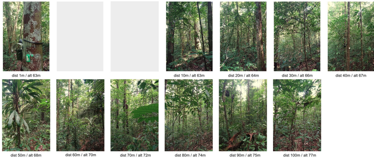
Table A-1 : Vegetation and landscape at each step along the 100 m propagation transect in the Neotropical rainforest (French Guiana, France). No measurement was performed at 2 and 5 m (gray rectangles).

Pictures of both propagation transects are shown in Table A-1 and A-2. The camera pointed in the direction of the microphone at about 1.5m above the ground. Vegetation is slightly denser in the Neotropical rainforest with more foliage. The maximum visibility is about 10m in both forests.