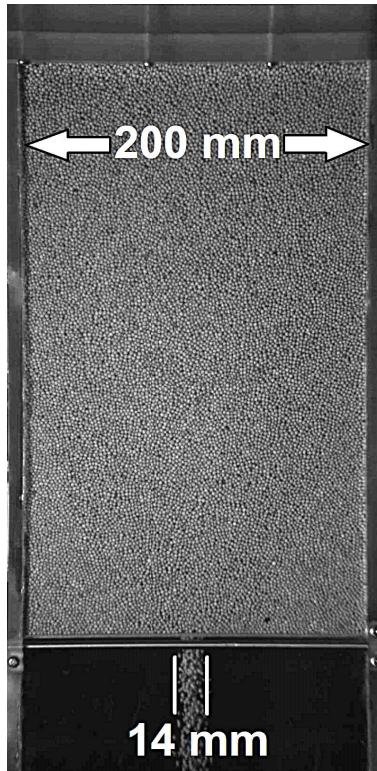
Figure 1. A formatted image showing the silo test area during an experiment with mustard seed and a centrally located exit orifice.