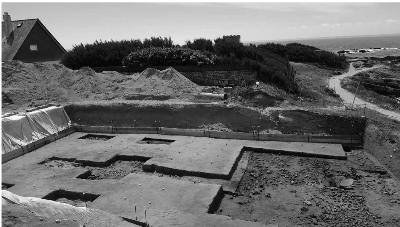
Fig. 3 – Beg-er-Vil (Quiberon, Morbihan). In 2017, the mechanical stripping of the dune (1.8 m thick) and of the overlying parking lot allows to explore the surroundings of the Mesolithic shell midden. At right on the photo is a pit-hearth in the centre of a circular hut.