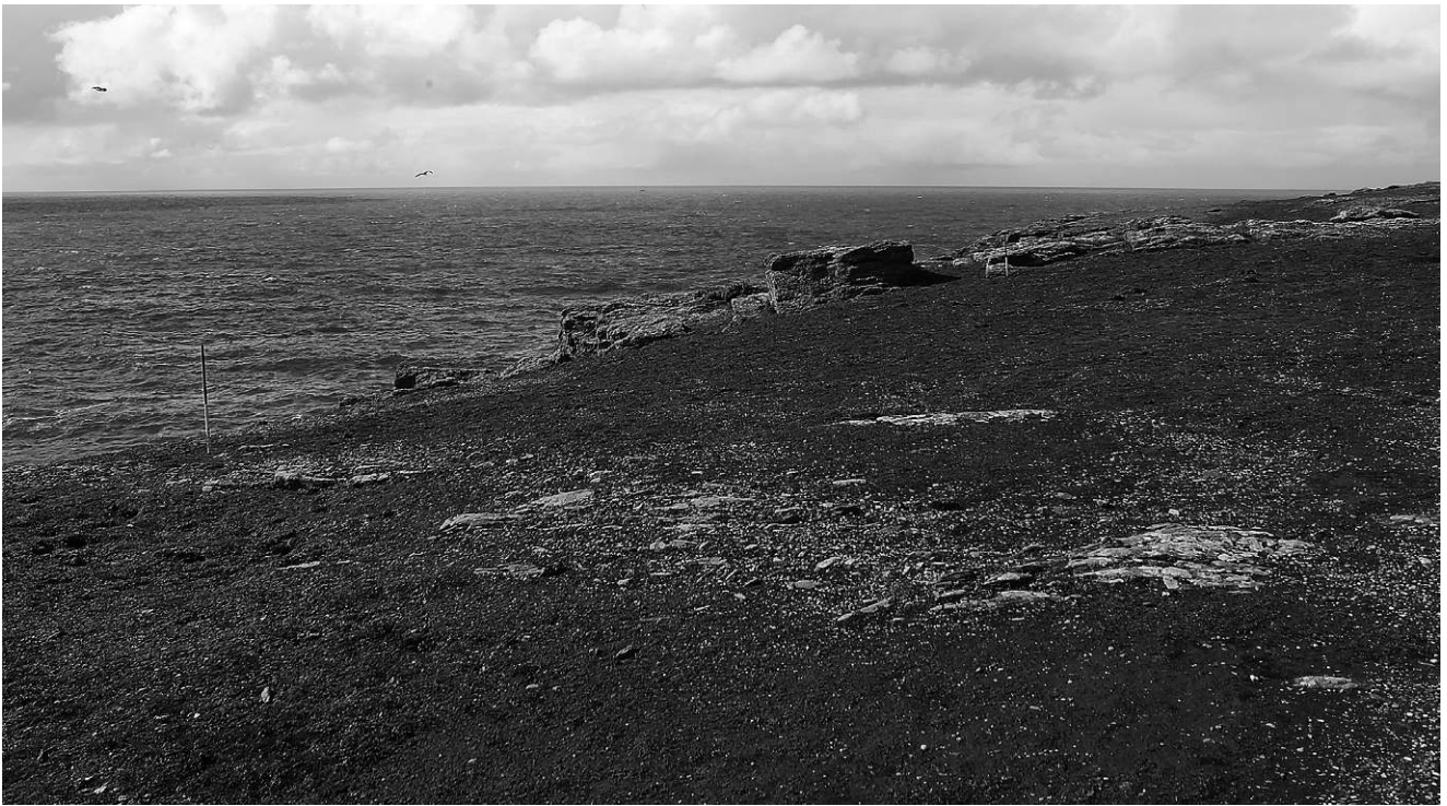
Fig. 5 – Le Gorzed (Groix, Morbihan). The widespread flint around the coastal path bears witness to the presence of a Late Mesolithic habitat (Discovery : A. Le Guen. Photo: G-A. Denat