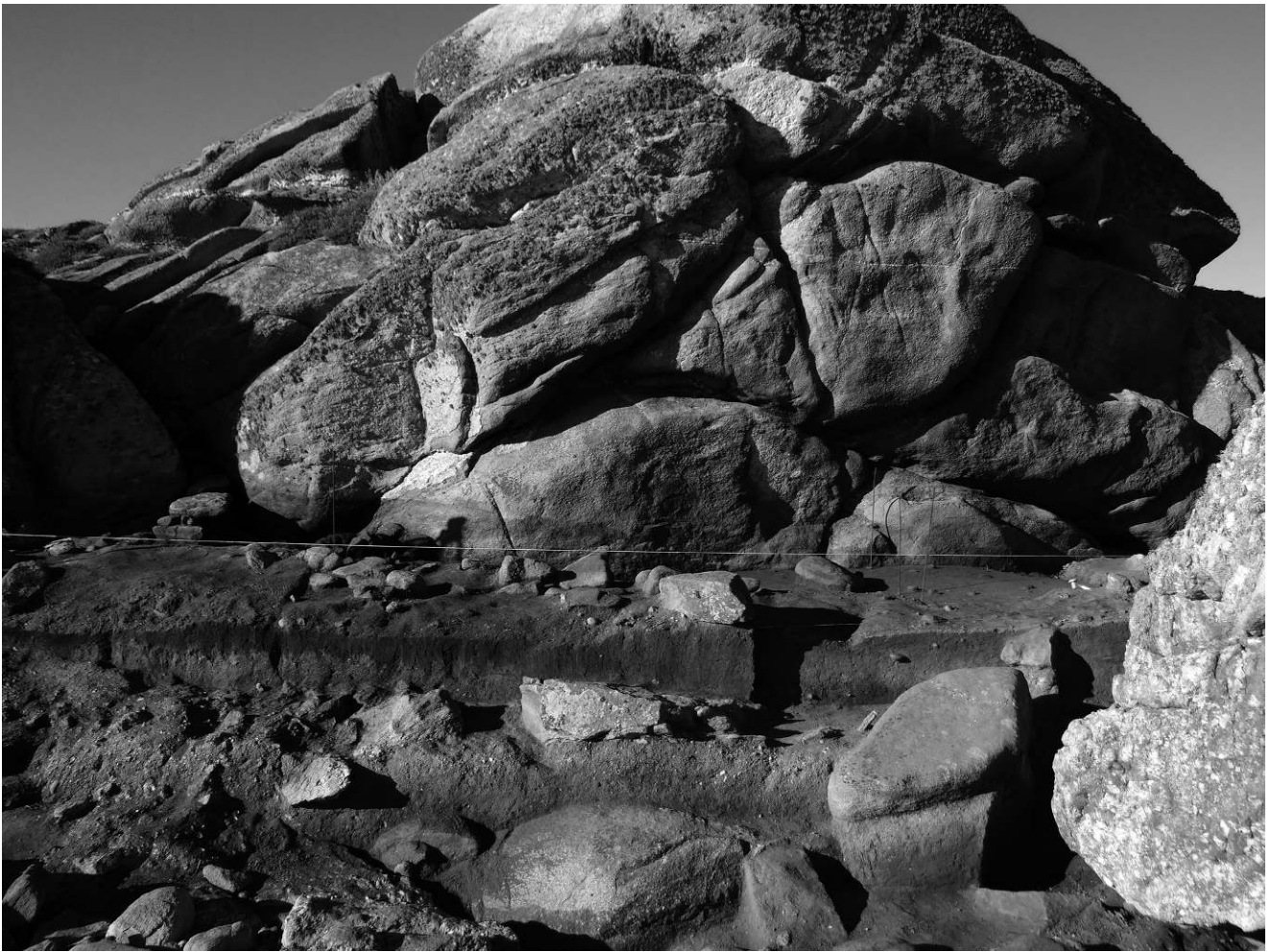
Fig. 4 – Roc'h Santeg Leton (Santec, Finistère), Western Block. The section is thick of 1 m with remains of Protohistory (Gallic) and Prehistory (Middle Paleolithic, Early Neolithic, Early and Late Mesolithic).