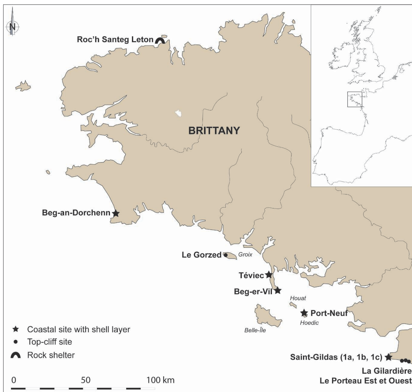
Fig. 1 – Location and types of Mesolithic sites mentioned in the text. Credit: CAD: G. Marchand

The knowledge about Mesolithic groups with a maritime economy in France is largely dependent on the four large shell middens of southern Brittany, Beg-