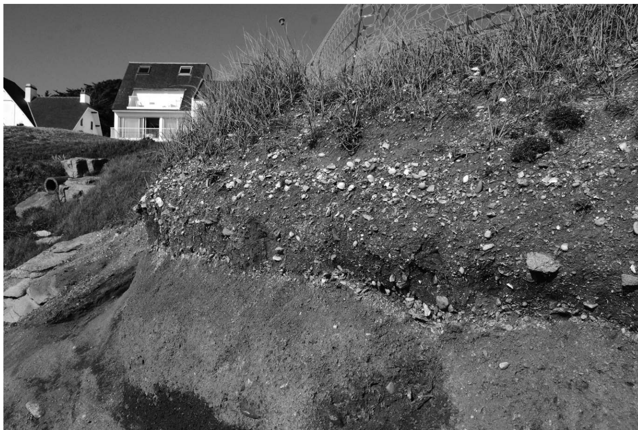
Fig. 2 – Beg-er-Vil (Quiberon, Morbihan). The Mesolithic shell layer is sandwiched between a Pleistocene beach and a dune.