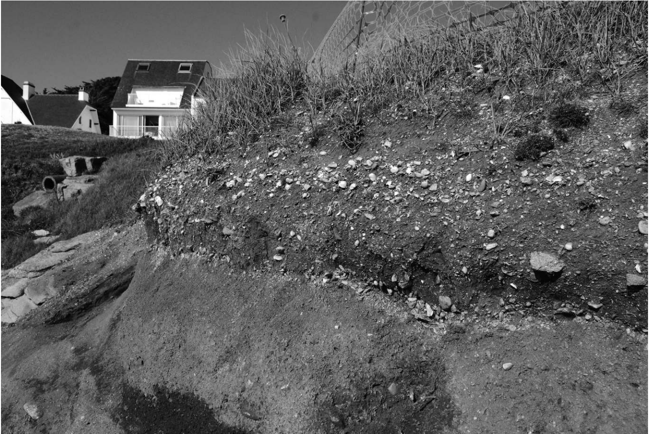
Fig. 2 – Beg-er-Vil (Quiberon, Morbihan). The Mesolithic shell layer is sandwiched between a Pleistocene beach and a dune.