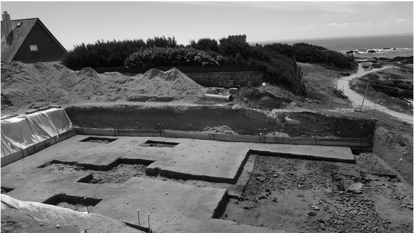
Fig. 3 – Beg-er-Vil (Quiberon, Morbihan). In 2017, the mechanical stripping of the dune (1.8 m thick) and of the overlying parking lot allows to explore the surroundings of the Mesolithic shell midden. At right on the photo is a pit-hearth in the centre of a circular hut.