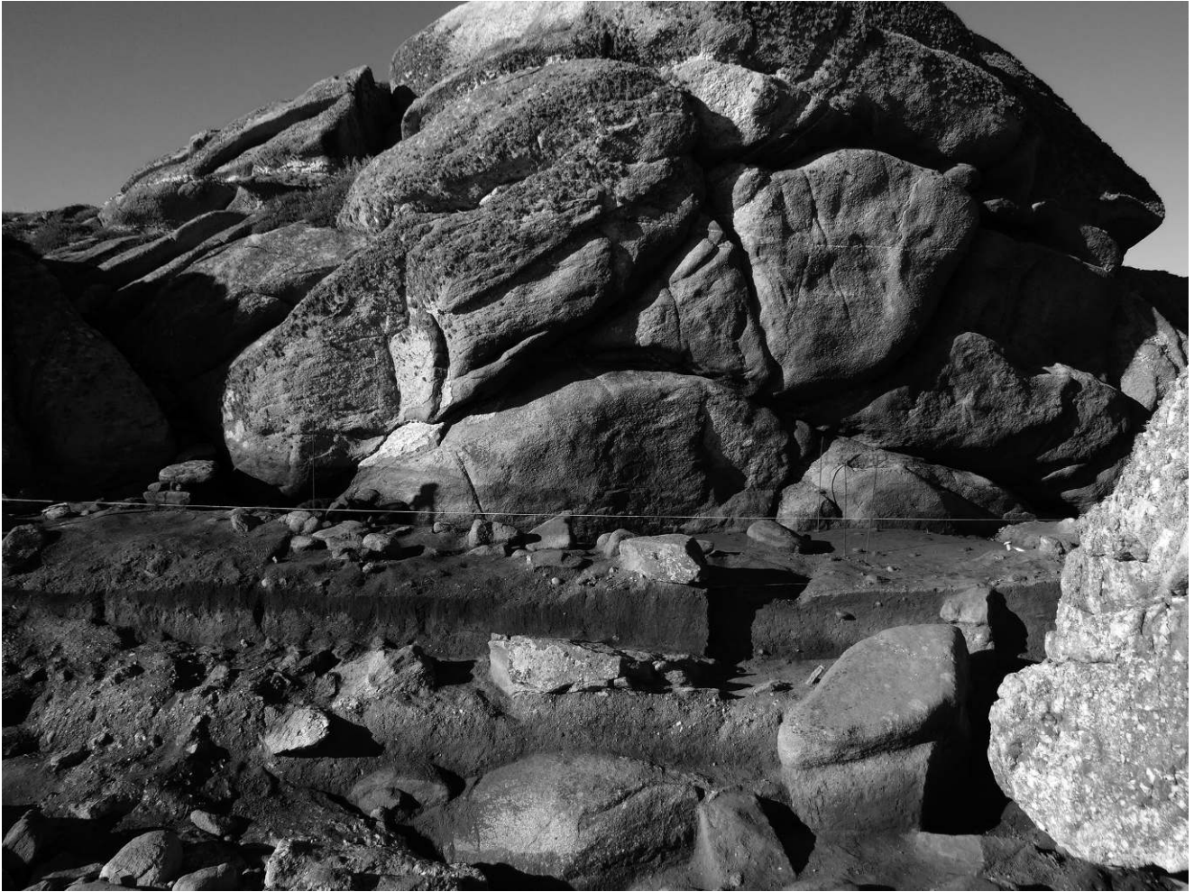
Fig. 4 – Roc'h Santeg Leton (Santec, Finistère), Western Block. The section is thick of 1 m with remains of Protohistory (Gallic) and Prehistory (Middle Paleolithic, Early Neolithic, Early and Late Mesolithic).